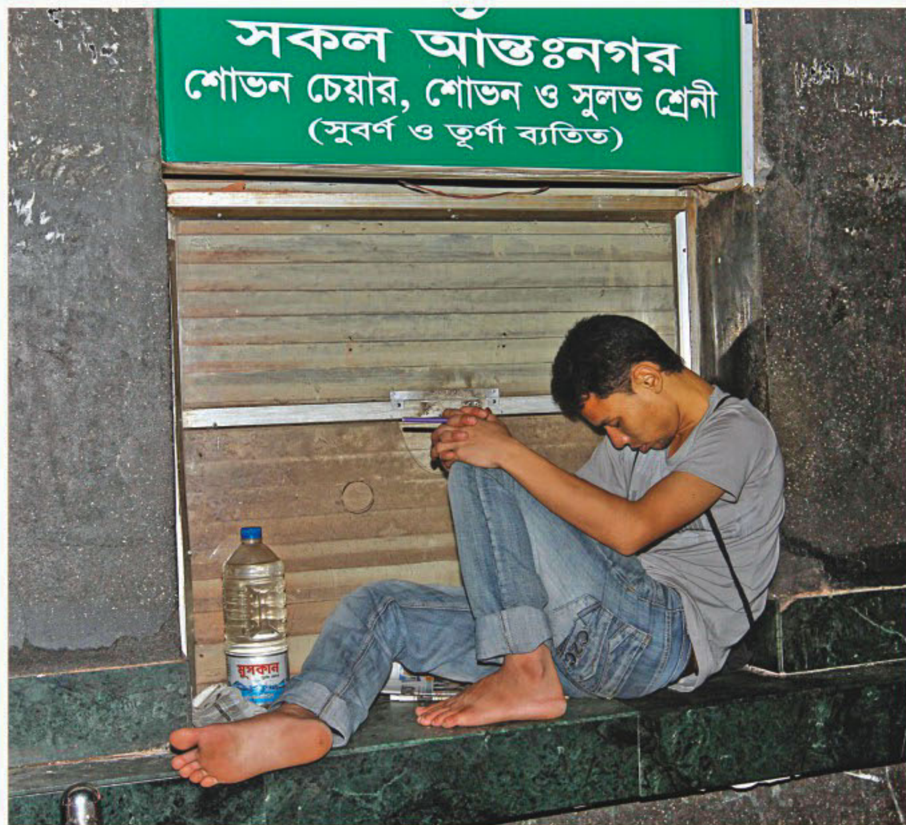
In an awkward position, a man sleeps on a ticket counter at Kamalapur Railway Station in the wee hours of yesterday to keep his first place in line for advance tickets for Eid. He had been waiting there since 5:00pm Saturday. He got the tickets around 9:00am yesterday.