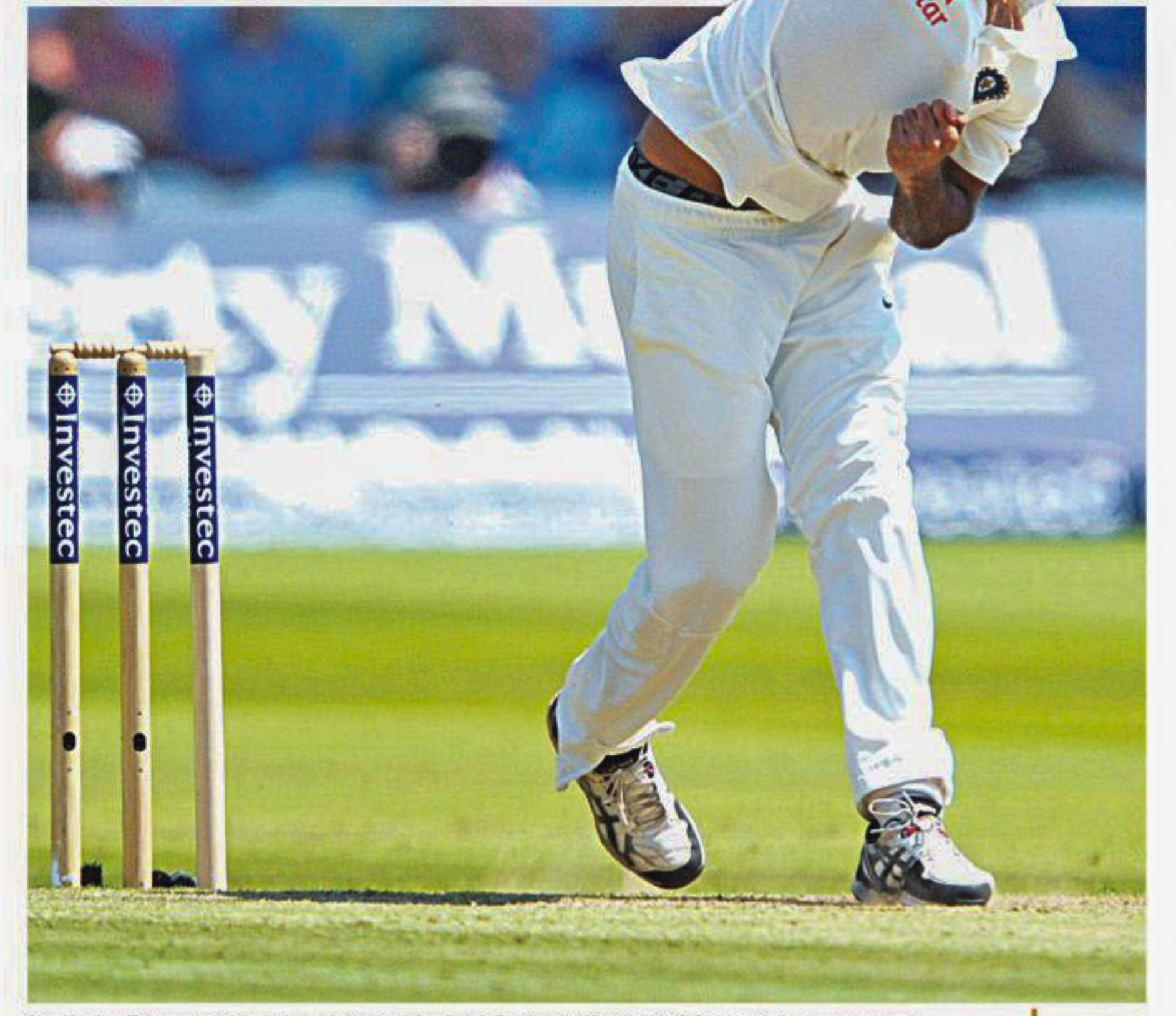
India's Bhuvneshwar Kumar is in his bowling stride on the second day of the second Test against England at Lord's yesterday.