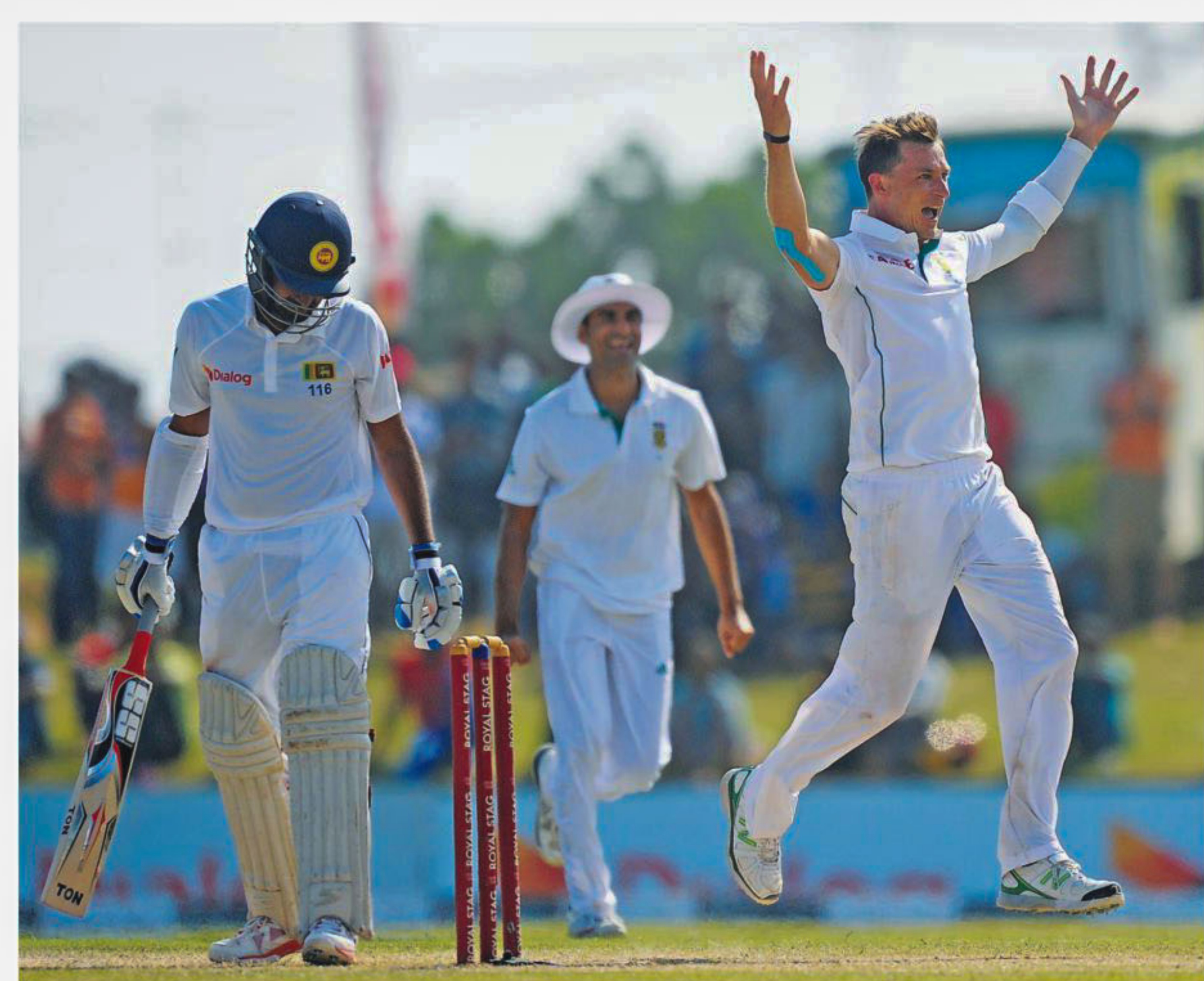
South Africa pacer Dale Steyn (R) jumps into the air in celebration after he dismissed Sri Lanka's Lahiru Thirimanne on the third day of the first Test at the Galle International Cricket Stadium yesterday.