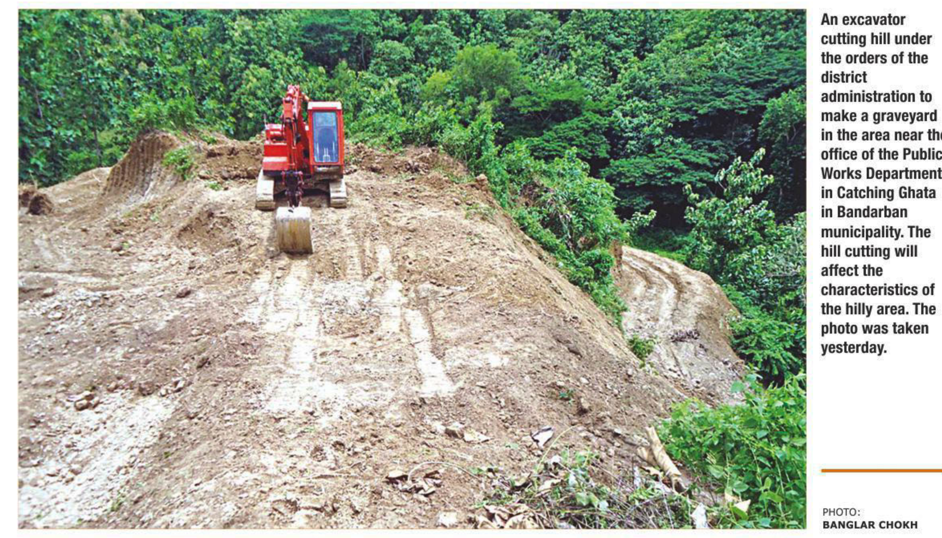
An excavator cutting hill under the orders of the district administration to make a graveyard in the area near the office of the Public Works Department in Catching Ghata in Bandarban municipality. The hill cutting will affect the characteristics of the hilly area. The photo was taken yesterday.