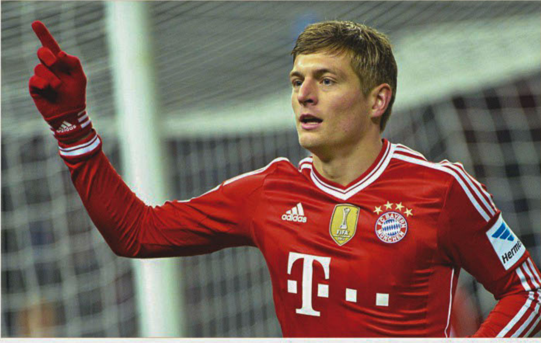
Real Madrid's latest signing Toni Kroos

Toni Kroos on Thursday became Real Madrid's first high profile signing for the new season, moving from Bayern Munich on a six-year deal just days after winning the World Cup with Germany. The 24-year-old playmaker had an outstanding World Cup, scoring two goals in two minutes in the 7-1 semifinal rout of Brazil, en route to overcoming Argentina 1-0 in Sunday's final. Spanish media said Real and Bayern agreed a deal worth between EUR25 million and EUR30 million ($33-$40 million). The two clubs said the transfer fee would remain secret. Kroos is due to be unveiled by his new employers at a press conference on Thursday. His arrival could hasten the departure of fellow German Sami Khedira who risks losing his midfield place. Real hailed their latest catch as "one of the most important players of the moment." A Real statement described Kroos as "a playmaker capable of finding the best option in any situation, with a vision of the game enabling him to help his teammates, as well as an impressive kick."