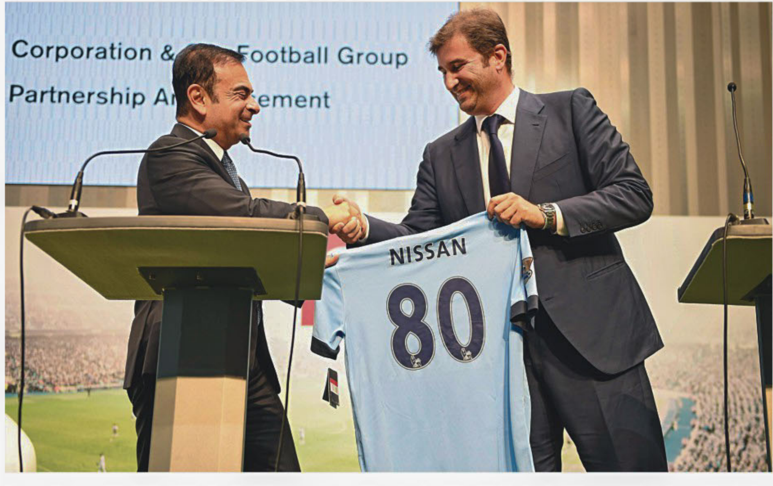
Ferran Soriano (R), CEO of City Football Group, gives a Manchester City shirt to Carlos Ghosn, CEO and president of Nissan Motor, during a press conference at Nissan's headquarters in Yokohama yesterday.

valued at $2.5 billion with the Dallas Cowboys, worth $2.3 billion, holding the fifth place. With 30 teams in the top 50, for the second consecutive year, the NFL occupies 60% of this year's list. The full list also included six teams from MLB and four from the NBA. The NFL's prominent standing on the list and the potential sale of the Los Angeles Clippers to former Microsoft head Steve Ballmer for $2 billion shows the value of big market sports teams in the USA is higher than ever.