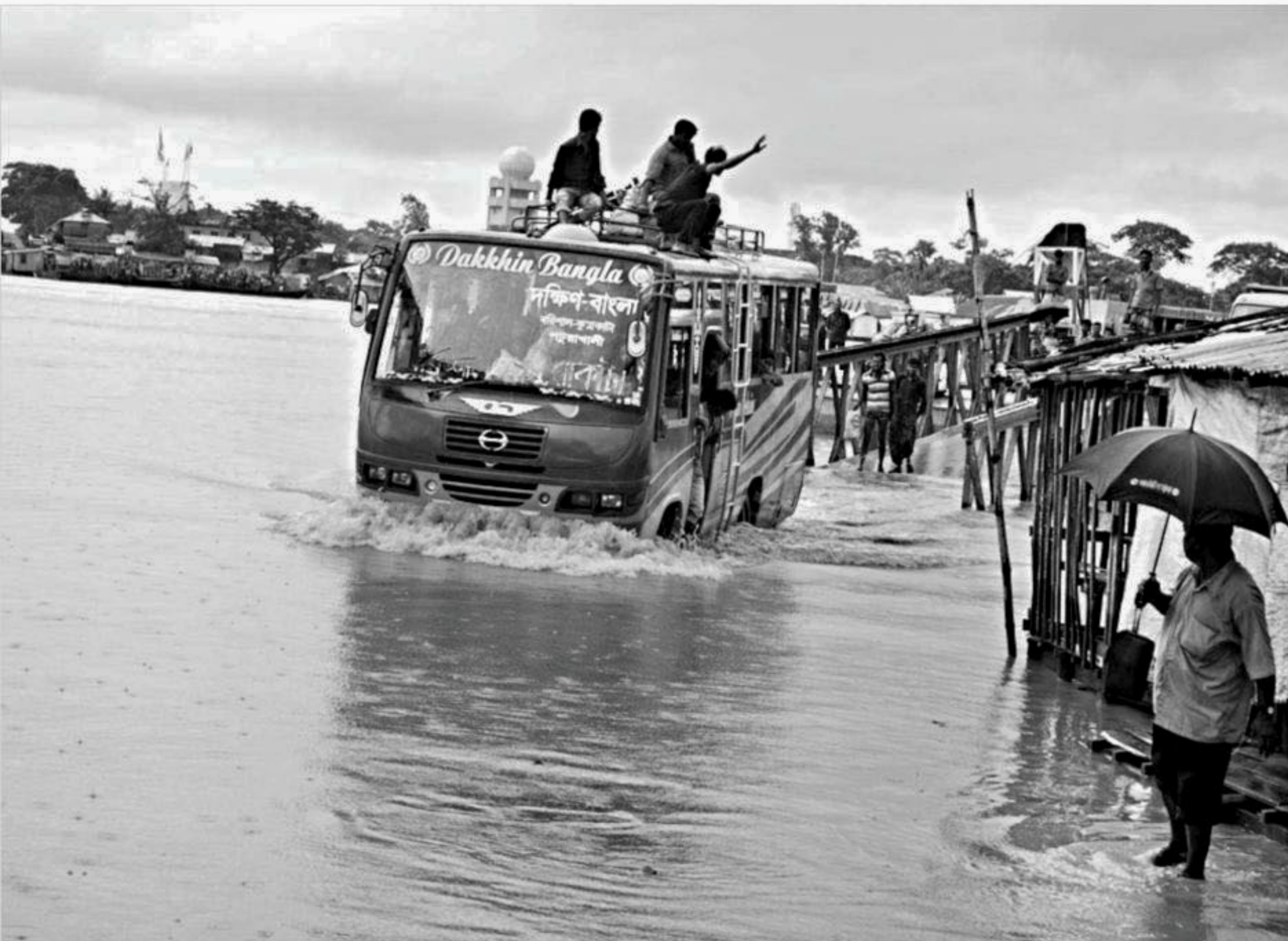
The gangways at Hajipur, Mohipur and Kalapara ferry terminals on Patuakhali-Kuakata road have gone under water due to tidal surge yesterday. This photo was taken from Nilganj end of Kalapara terminal.