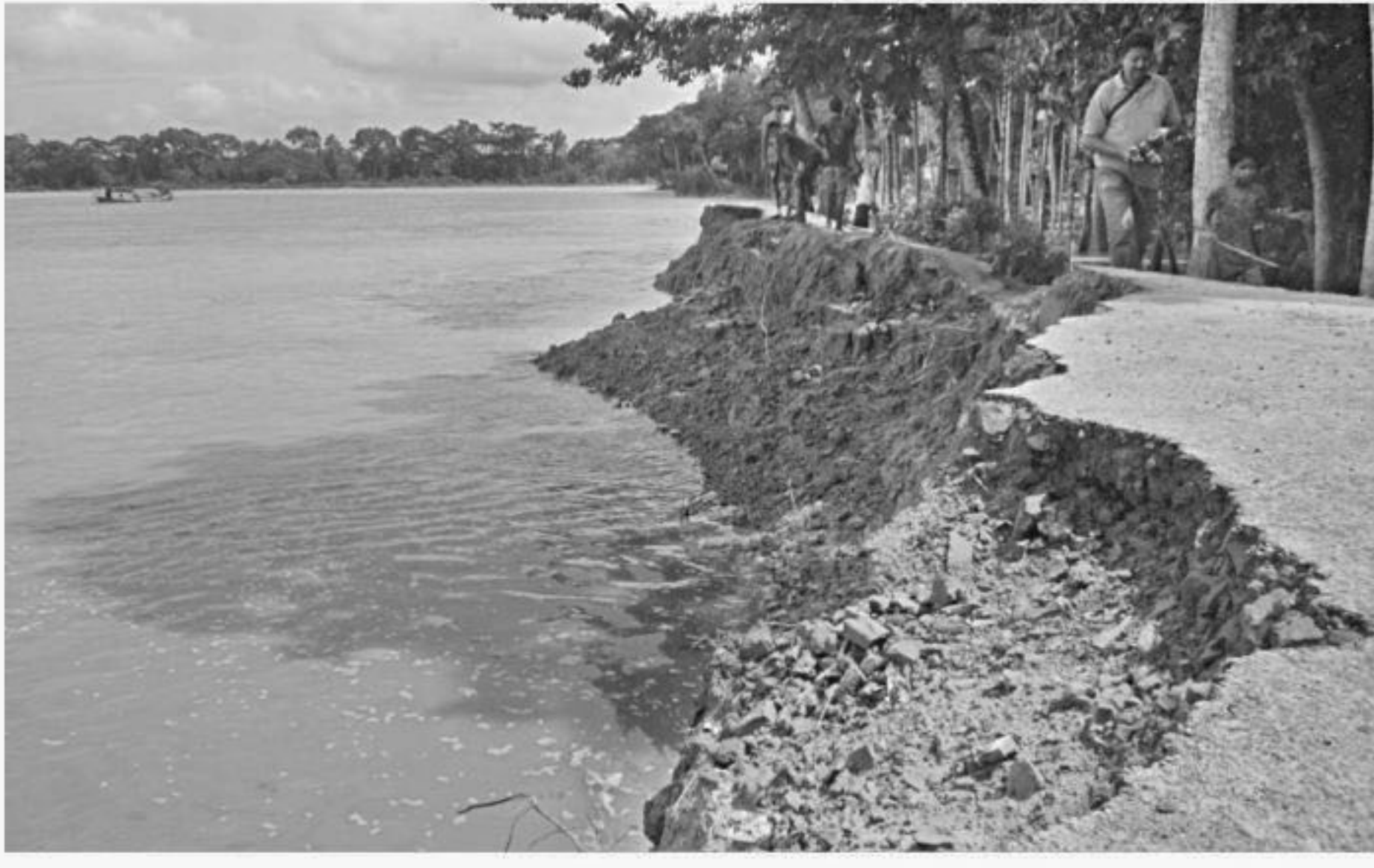
Over 300 dwelling houses at three villages under Patuakhali Sadar upazila have been inundated following collapse of a flood control dyke at Balaikathi point in the upazila