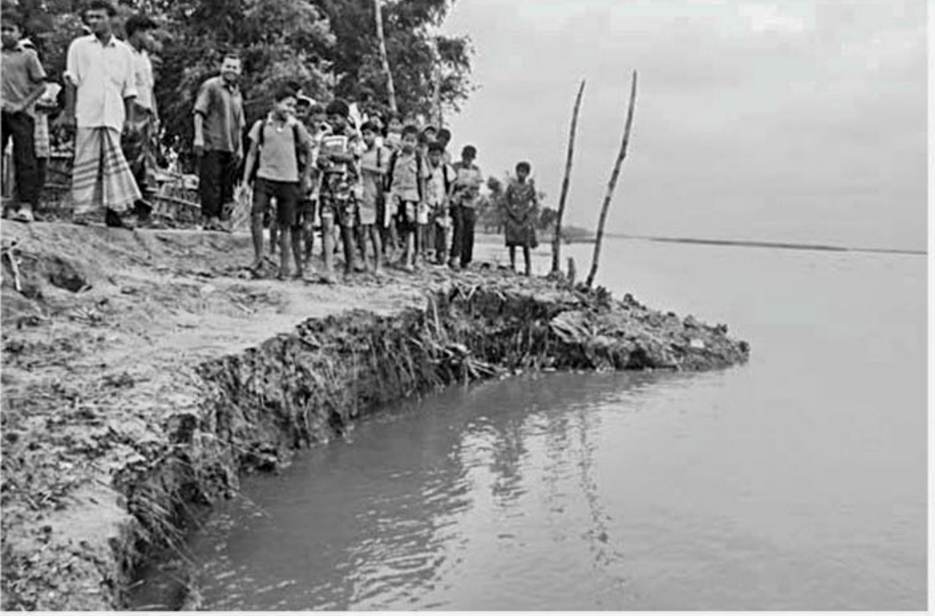
Erosion by the River Teesta rendered at least 50 families in three villages in Gangachara upazila of Rangpur homeless in 72 hours. The photo was taken from Char Chilakhal area yesterday.