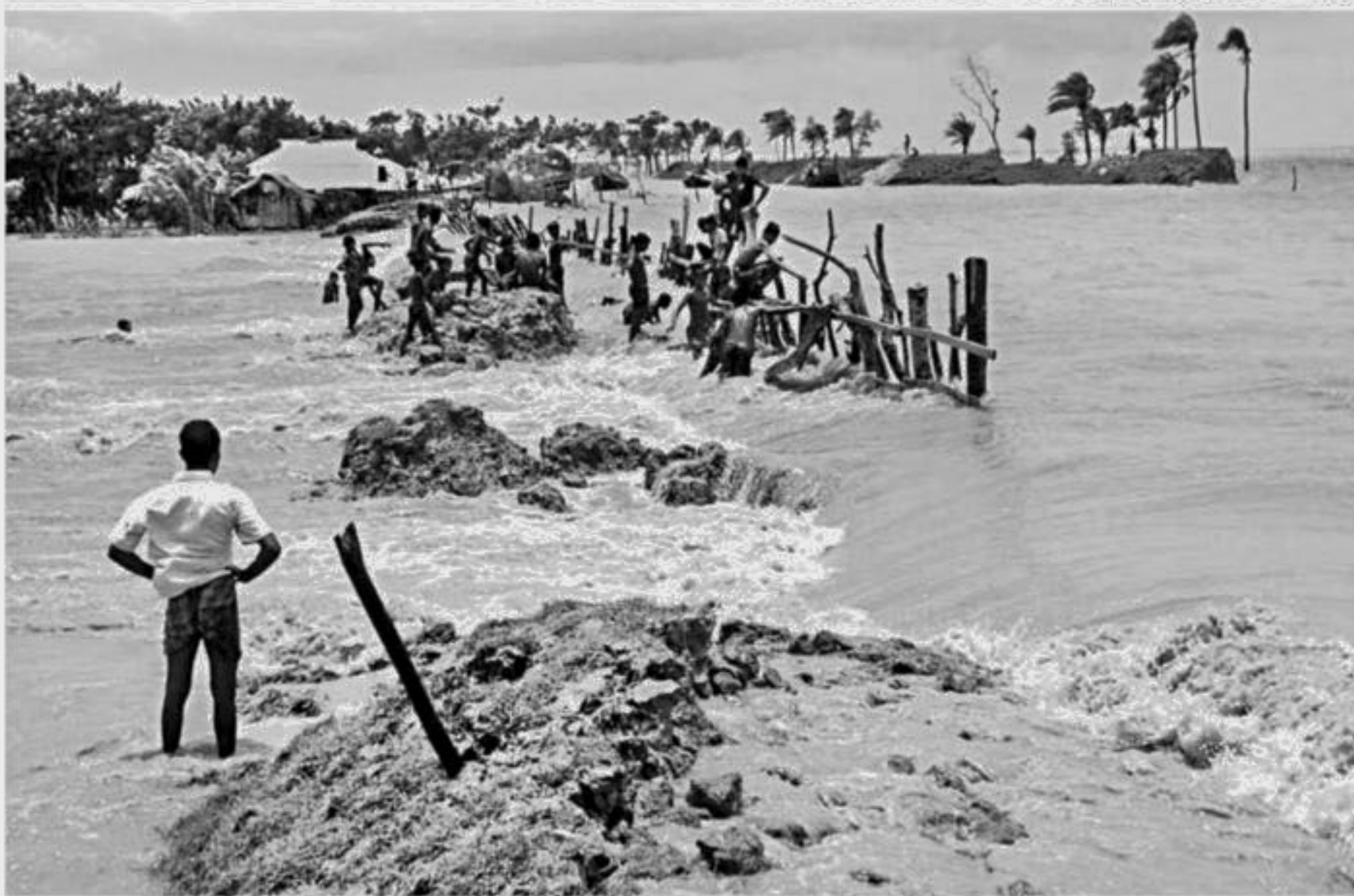
Ten villages in Nazirpur area and, above, five villages in Charipara area under Kalapara upazila of Patuakhali district got flooded following collapse of the flood control dykes in the areas due to strong tidal surge under the impact of full moon.