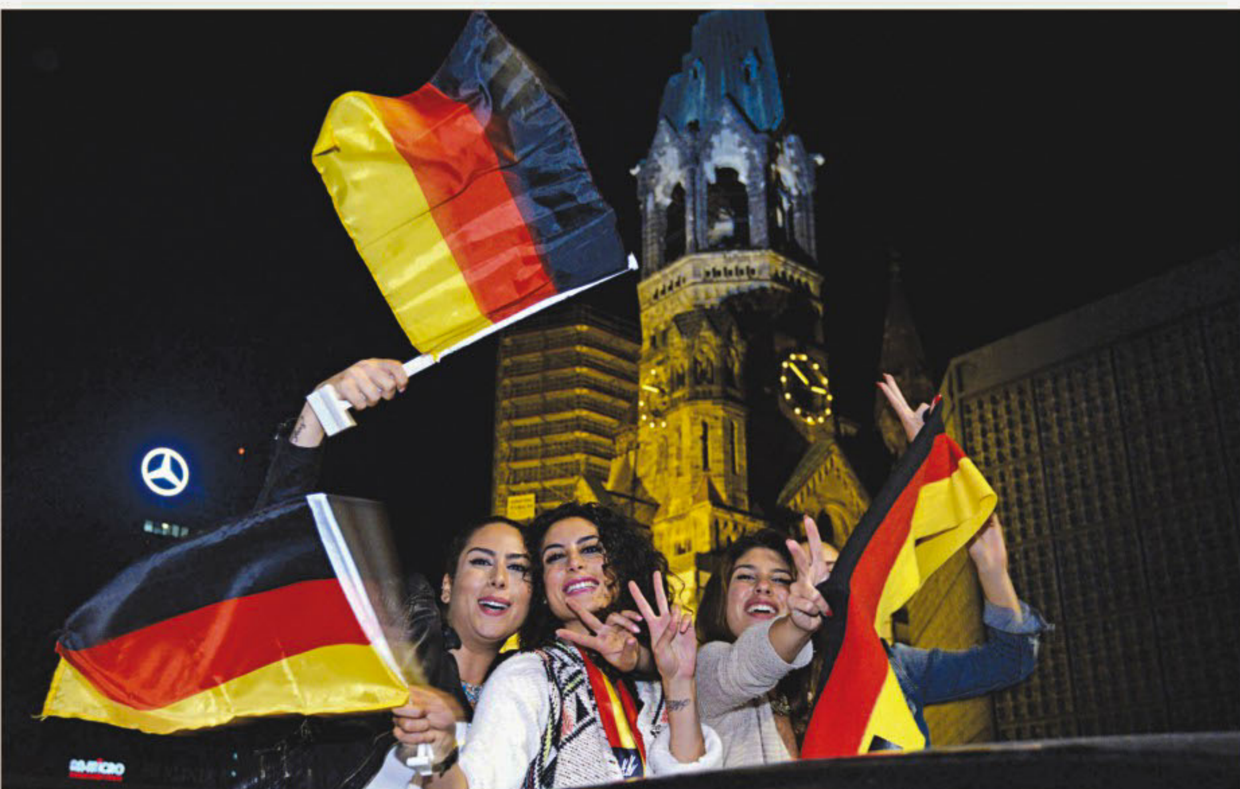
As the clock ticks down to 3 O'clock in the morning in the background, Germany fans are out on the streets of Berlin to celebrate their country's World Cup triumph in Brazil on Sunday.