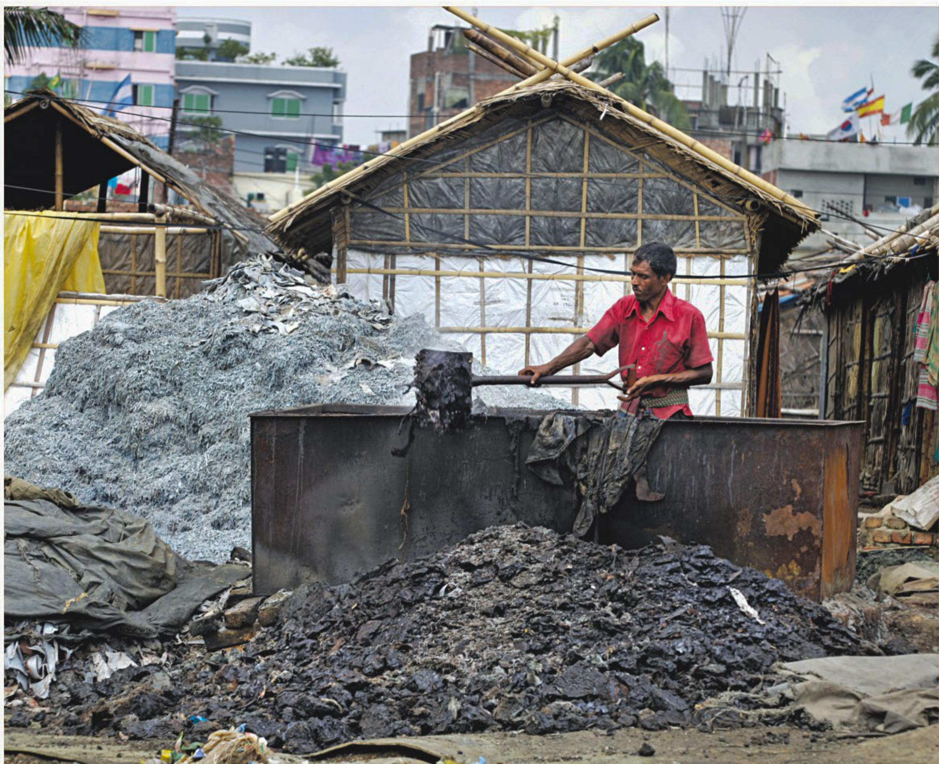
SOURCE OF CHROMIUM: A man in Hazaribagh boils tanned leather off-cuts -- the first step of manufacturing poultry feed. For tanning hide, industries use chromium. This is why poultry feed prepared from tannery waste contains the toxic chemical. More photos on Page 2.