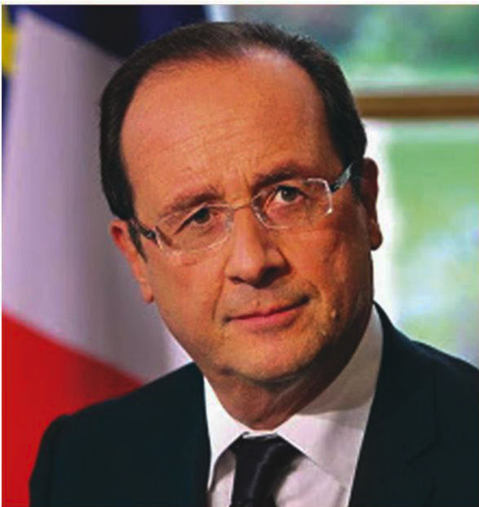
François HOLLANDE President of France