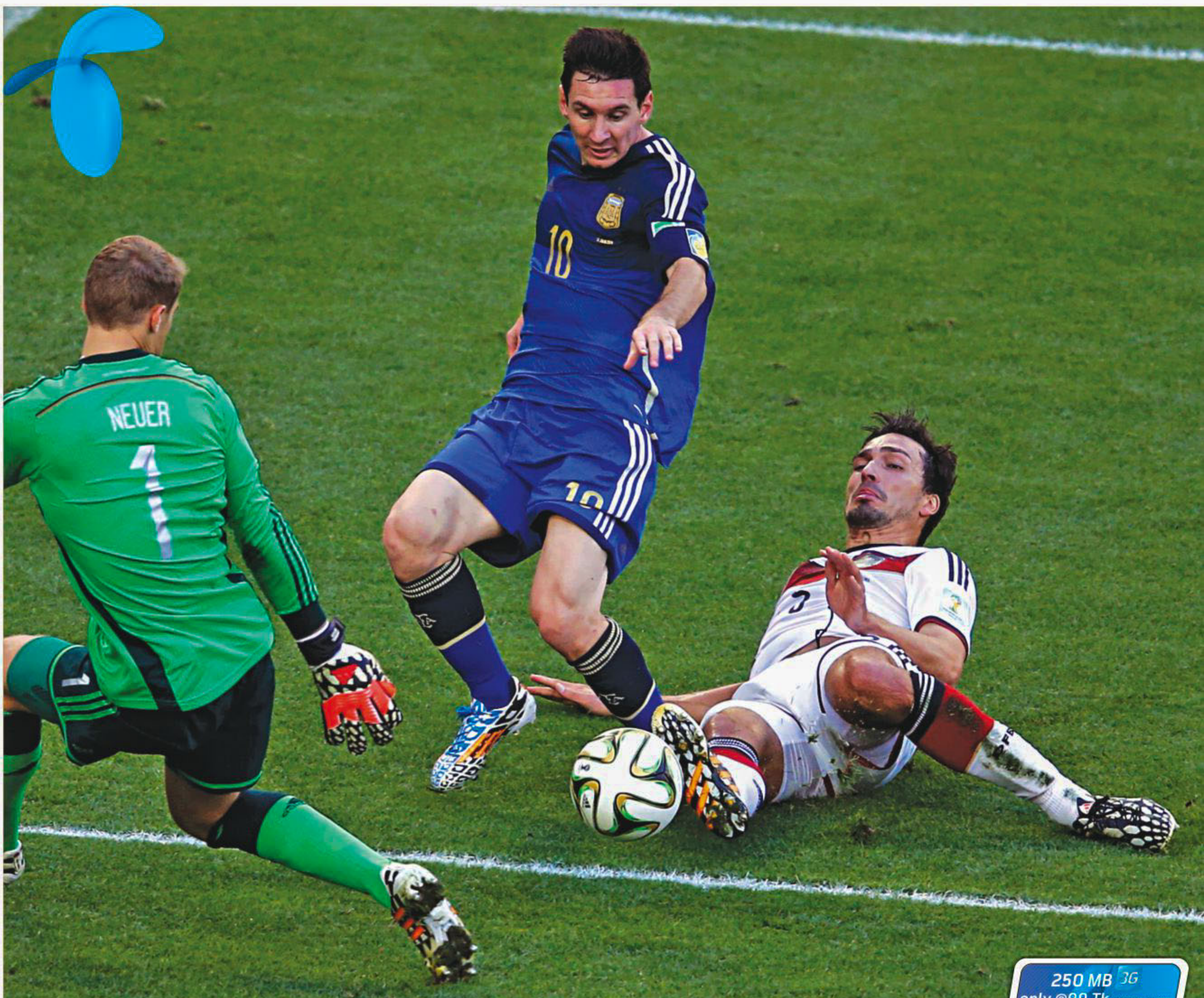
Argentina superstar Lionel Messi (C) came that much close to scoring against Germany in the gripping World Cup final at the Maracana Stadium in Rio de Janeiro on Sunday. The match was locked at nil-nil during the regulation 90 minutes.