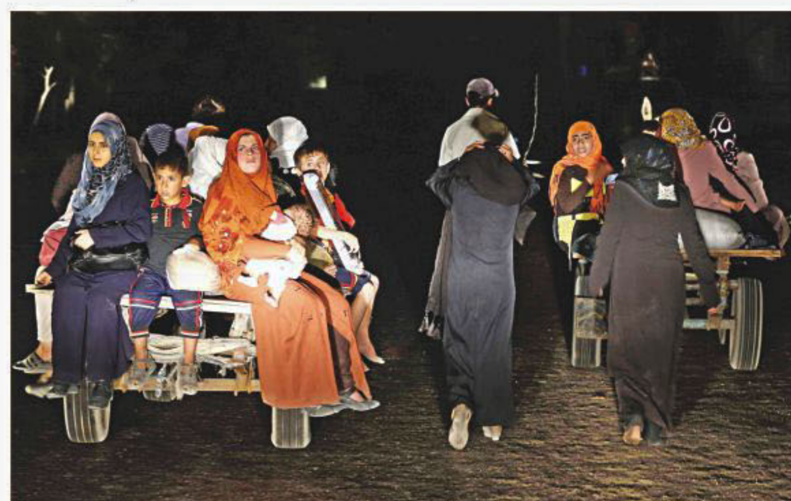
Palestinians travel to a shelter at a UN school after evacuating their homes near the border in Gaza City yesterday.

Naval commandos raid Gaza beach; death toll 166