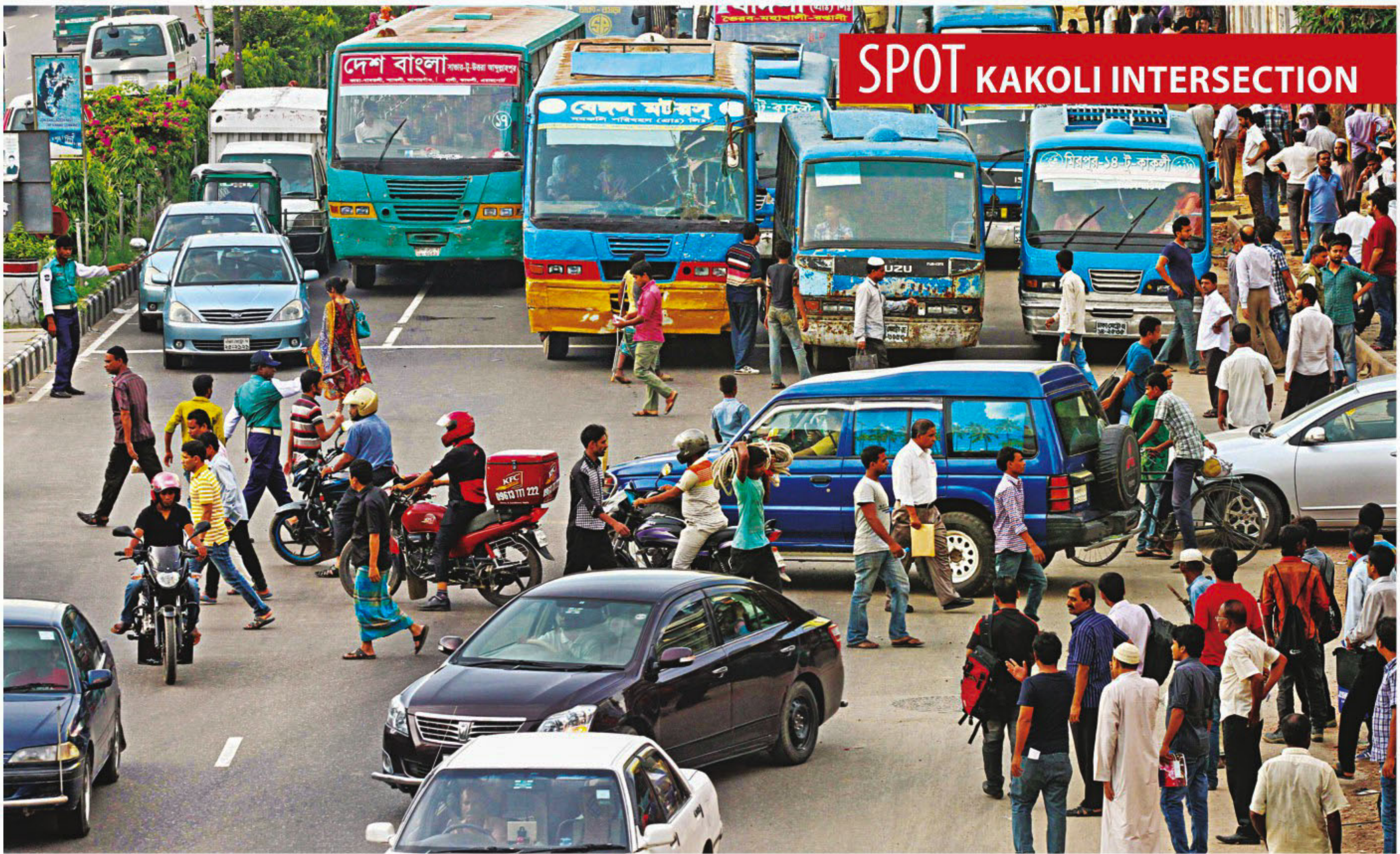
Cars and bikes, from the right side of the intersection, move ahead even though a traffic policeman signals them to wait. The photo was taken at the capital's Kakoli around 6:00pm yesterday.