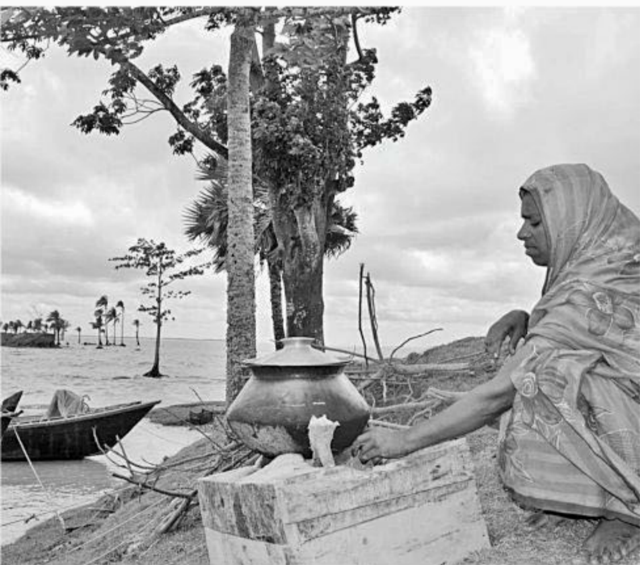
A flood victim, who has taken shelter on the embankment, is cooking food on an earthen oven in Chairapara area of Kalapara upazila, right, Labukhali ferry terminal is on the verge of collapse as the terminal protection dyke is being eroded due to high tide of the Payra River in Dumki upazila of Patuakhali district.