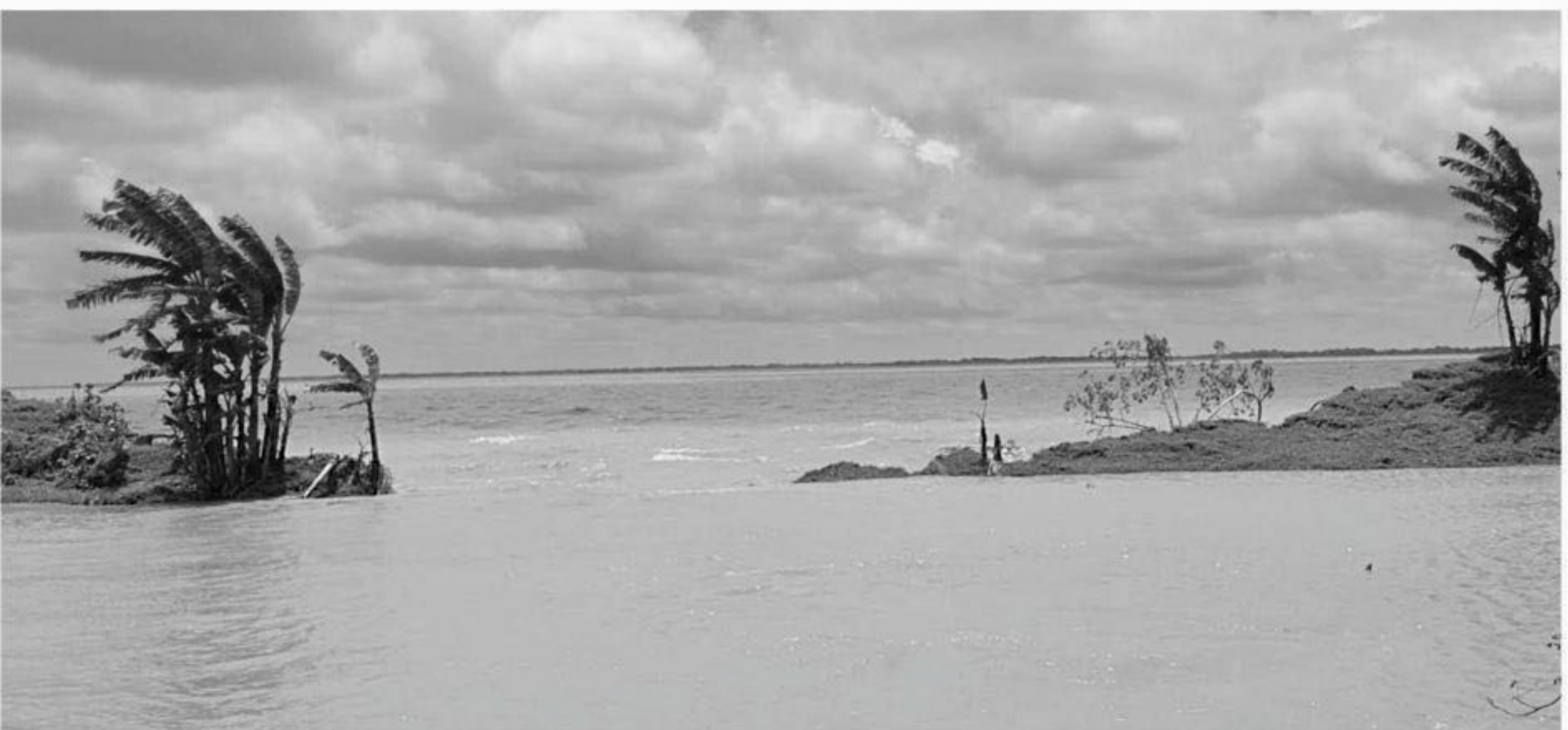
Saline water from Ramnabad River enters the villages and agricultural land through the breached portion of the flood control embankment in Lalua union under Kalapa upazila of Patuakhali.