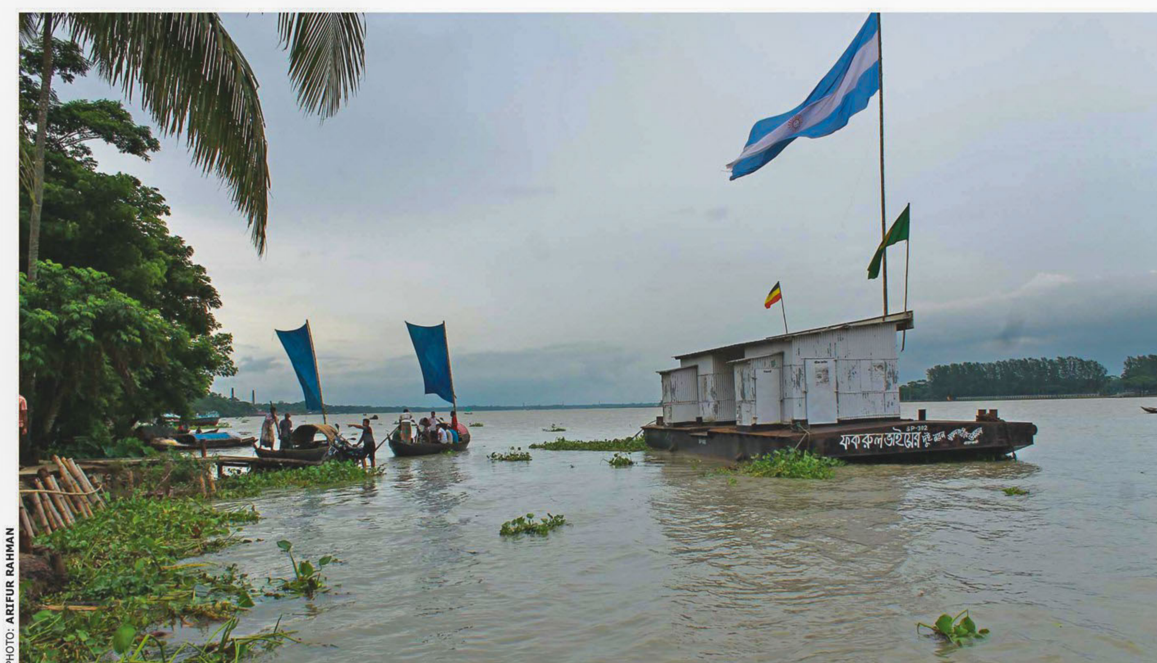
This pontoon has been floating useless in the middle of the Sindhya river since 2007, after Cyclone Sidr destroyed the terminal at Uttar Kourikhara in Swarupkathi of Pirojpur. Since then no authorities cared to rebuild the terminal and bring back the pontoon to it. Two years ago, local residents took up a fundraiser and built a makeshift wooden terminal, but that also did not last long. Nowadays all local and inter-district vessels are forced to moor at least a kilometre away. The photo was taken on Tuesday.