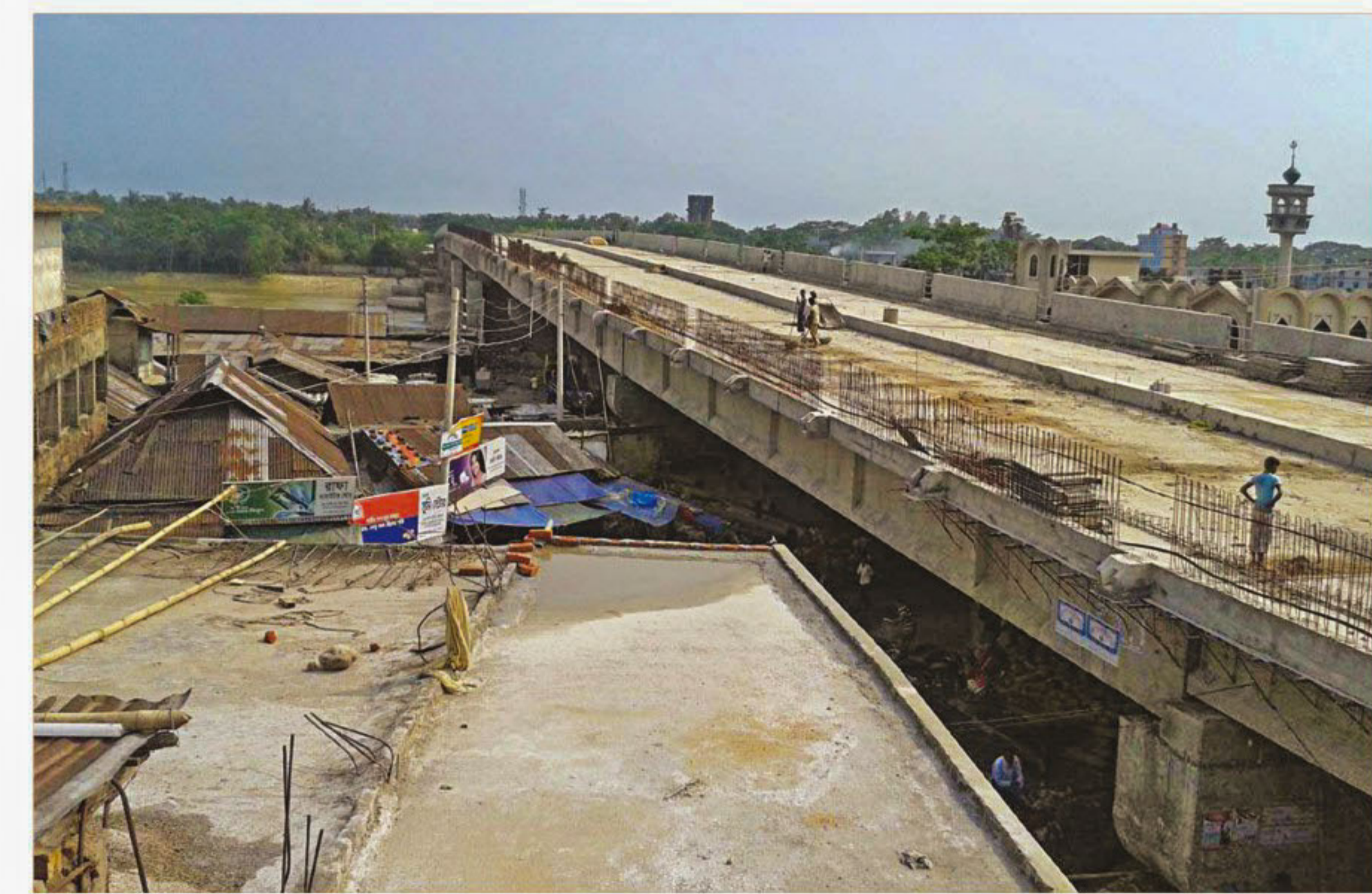
The unfinished Kazirbazar Bridge in Sylhet city recently. The construction began during BNP's tenure in 2006 and was supposed to be completed by 2008. But it has been limping for the last eight years, mainly due to a lack of political goodwill. The project had been totally suspended for four years from 2007 to 2011, when a caretaker government and an Awami League administration ruled the country.