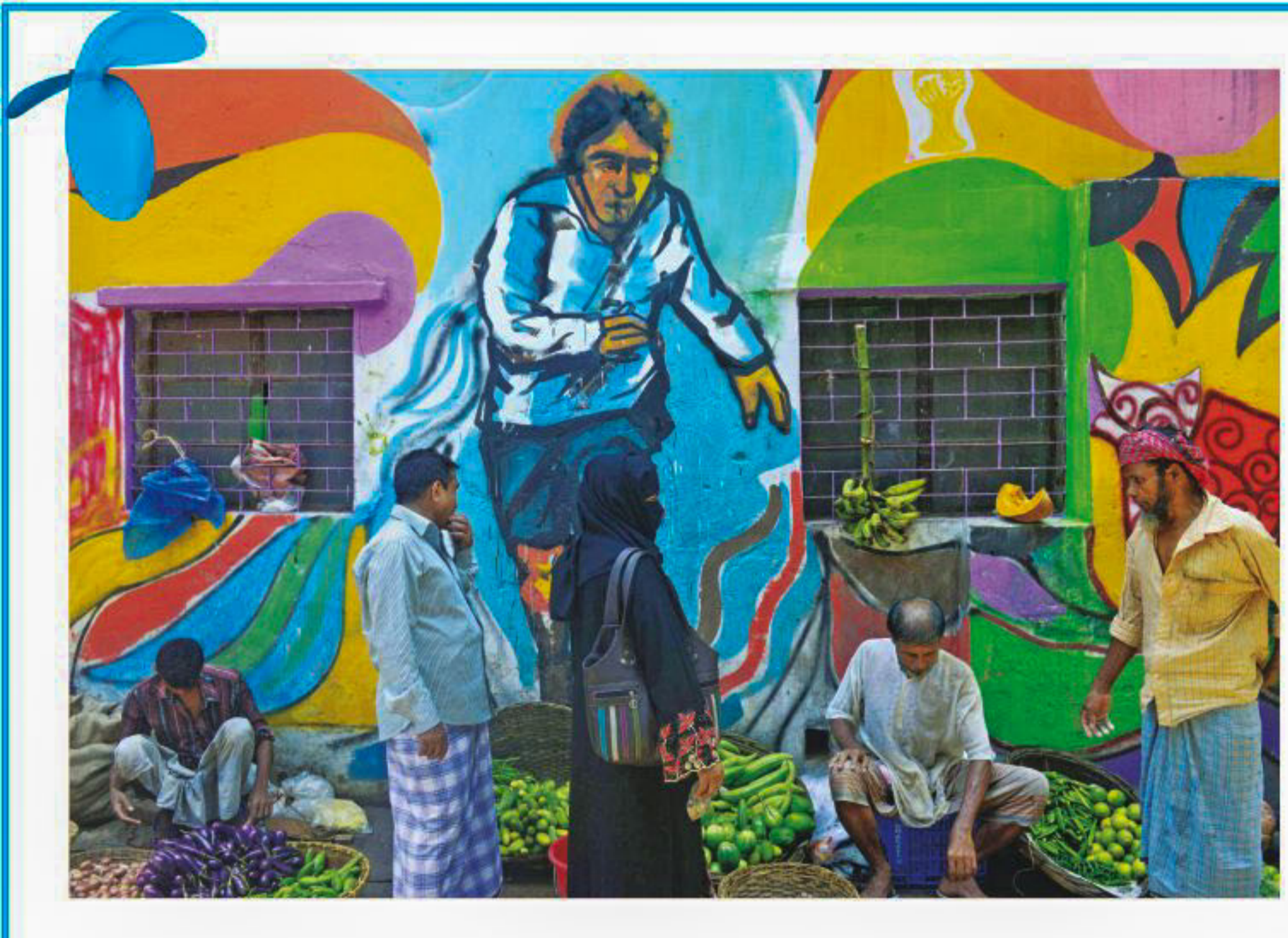
Street vendors sell vegetables in front of a painting of Argentina football superstar Lionel Messi in the old part of Dhaka city on Thursday.