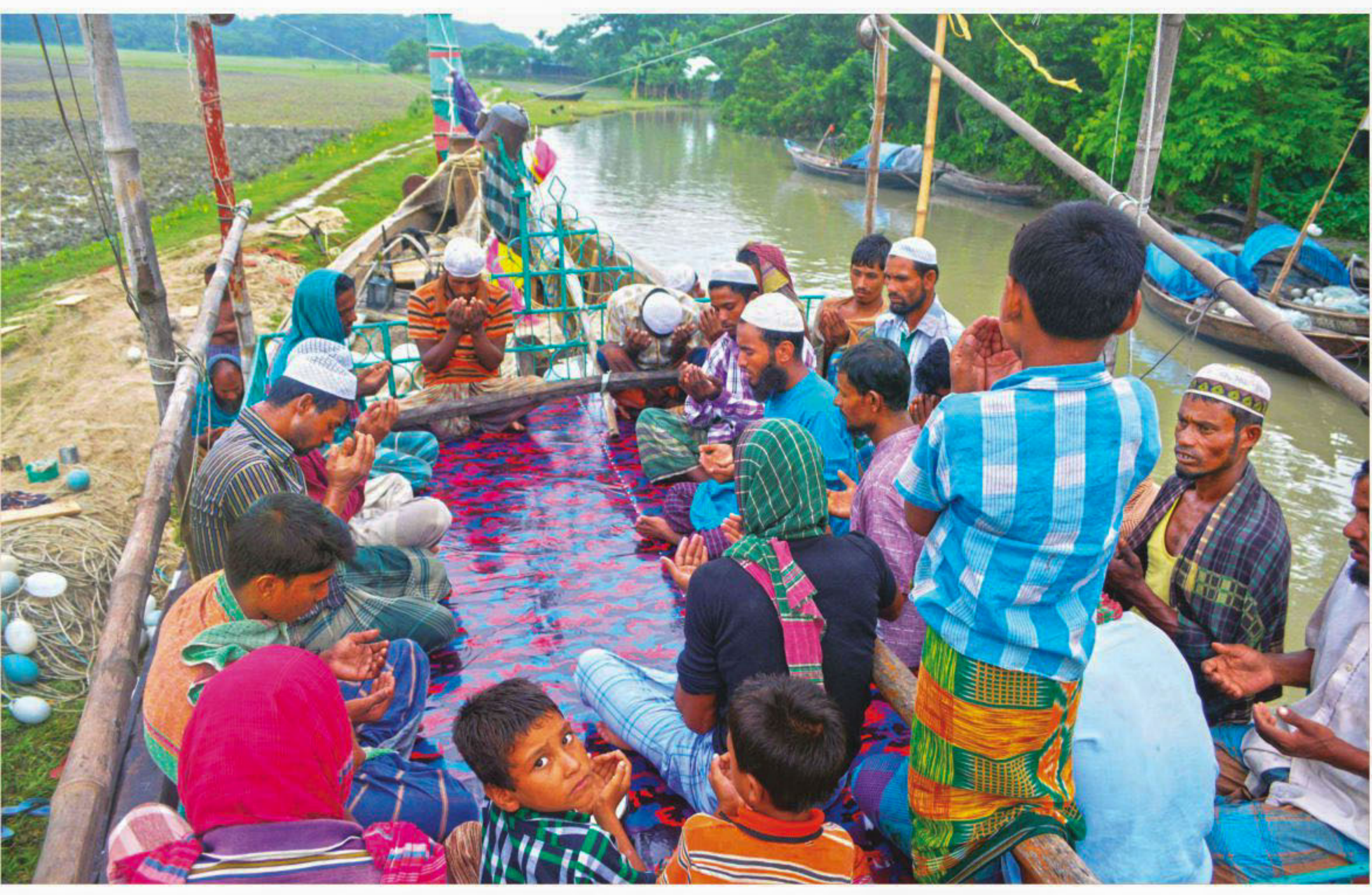
Fishermen offer special prayers on their boat at Char Wadel in Patuakhali yesterday following poor hilsa catch. Even though this is the peak of the season, their catch has been appalling spiraling hilsa prices in the kitchen market. Story on page 11