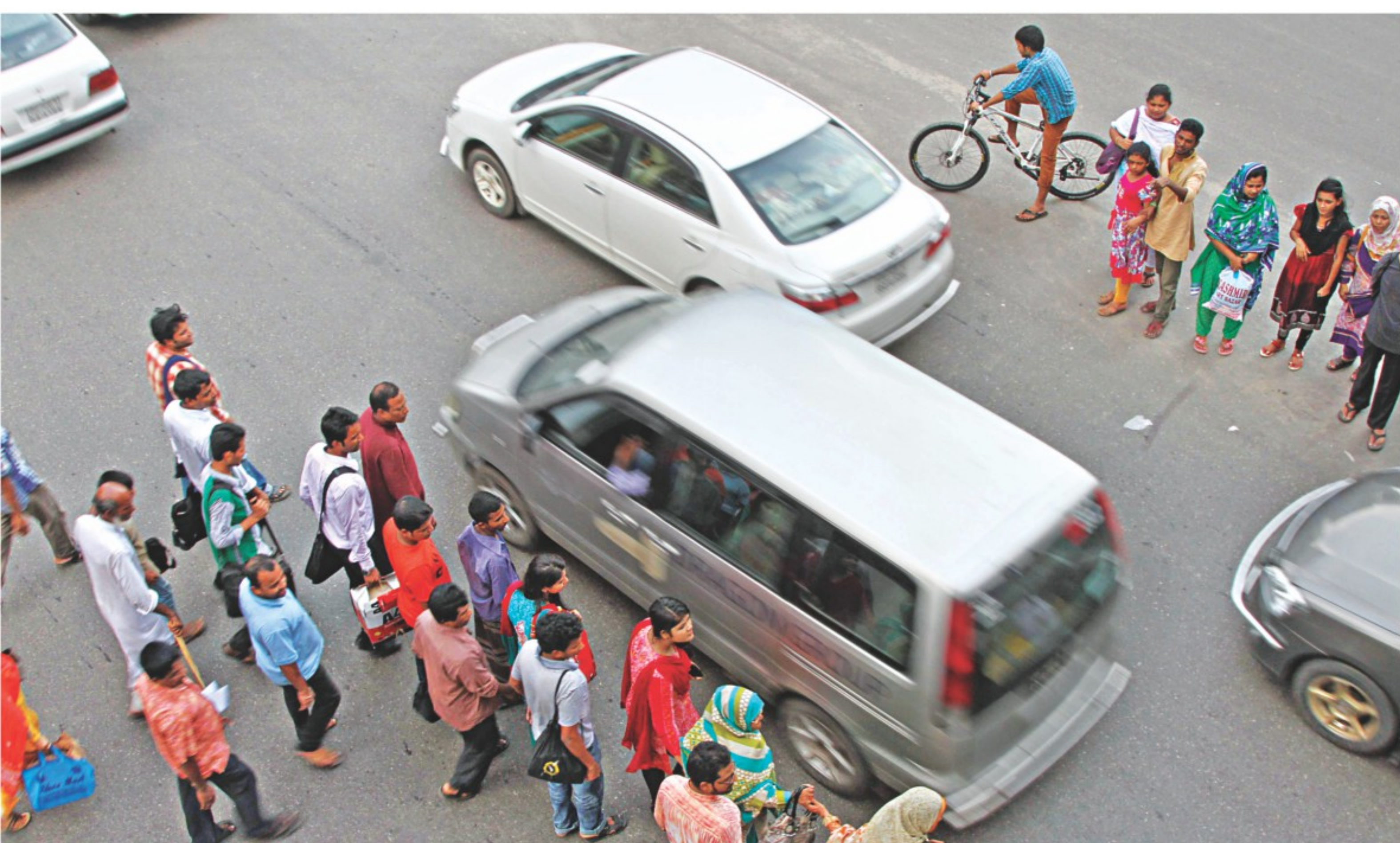
Commuters cross the road at Banglamotor intersection in the capital on Saturday, putting their lives at risk, though there is a footbridge at the very spot.