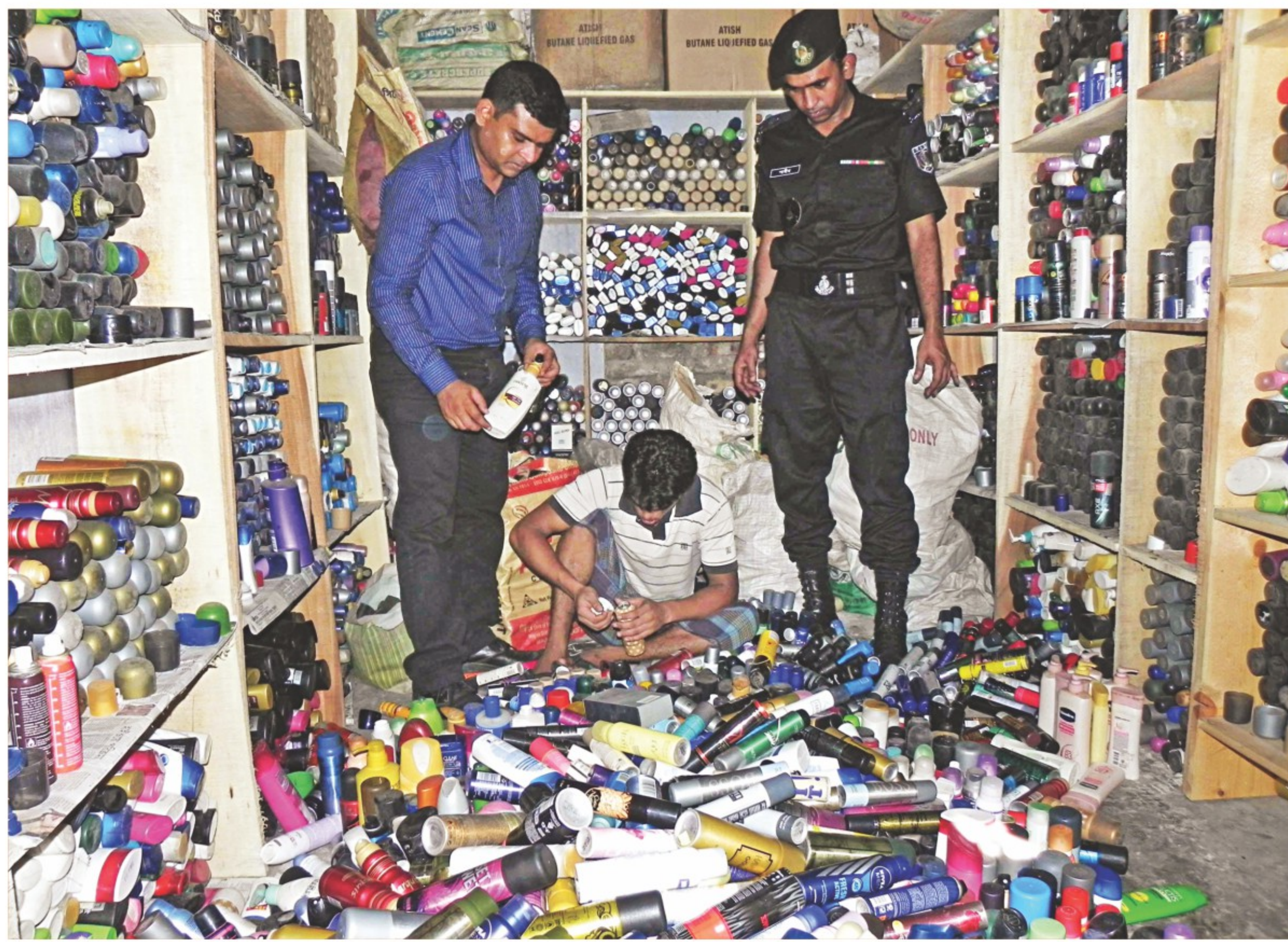
A mobile court along with a Rab team seizes fake cosmetics at a factory in the capital's Malitola yesterday.