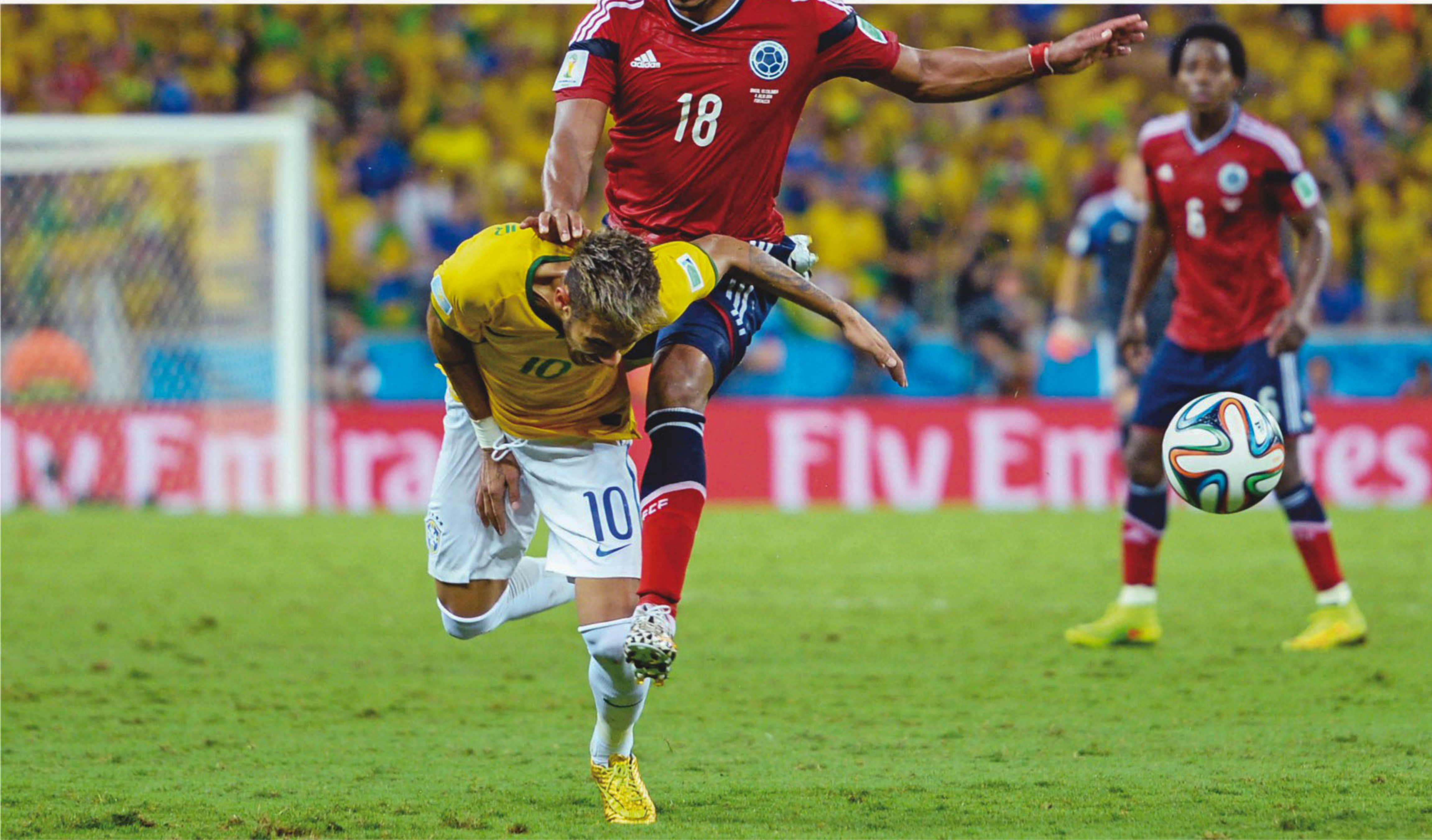
Cruel Colombian ... Juan Camilo Zuniga (No. 18) Knees Brazil forward Neymar out of the World Cup on Friday.