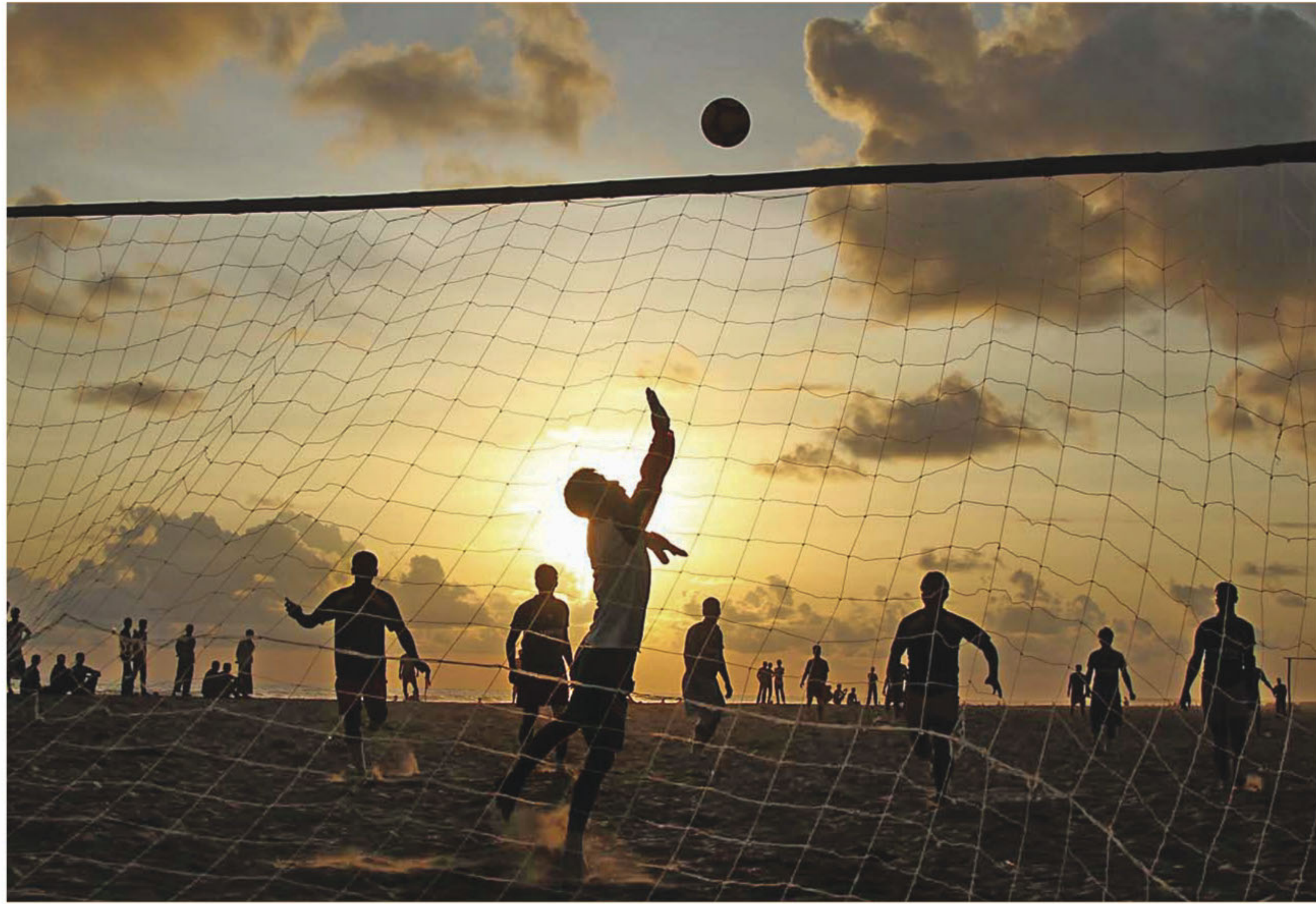
Certainly it's not Rio de Janeiro's famous Copacabana Beach in Brazil, now the centre of attraction in world football. It's a tranquil beach in Cox's Bazar. The mood, though, is identical everywhere as some youths are seen here enjoying a game of football in the coastal town, with the sun setting on the horizon.