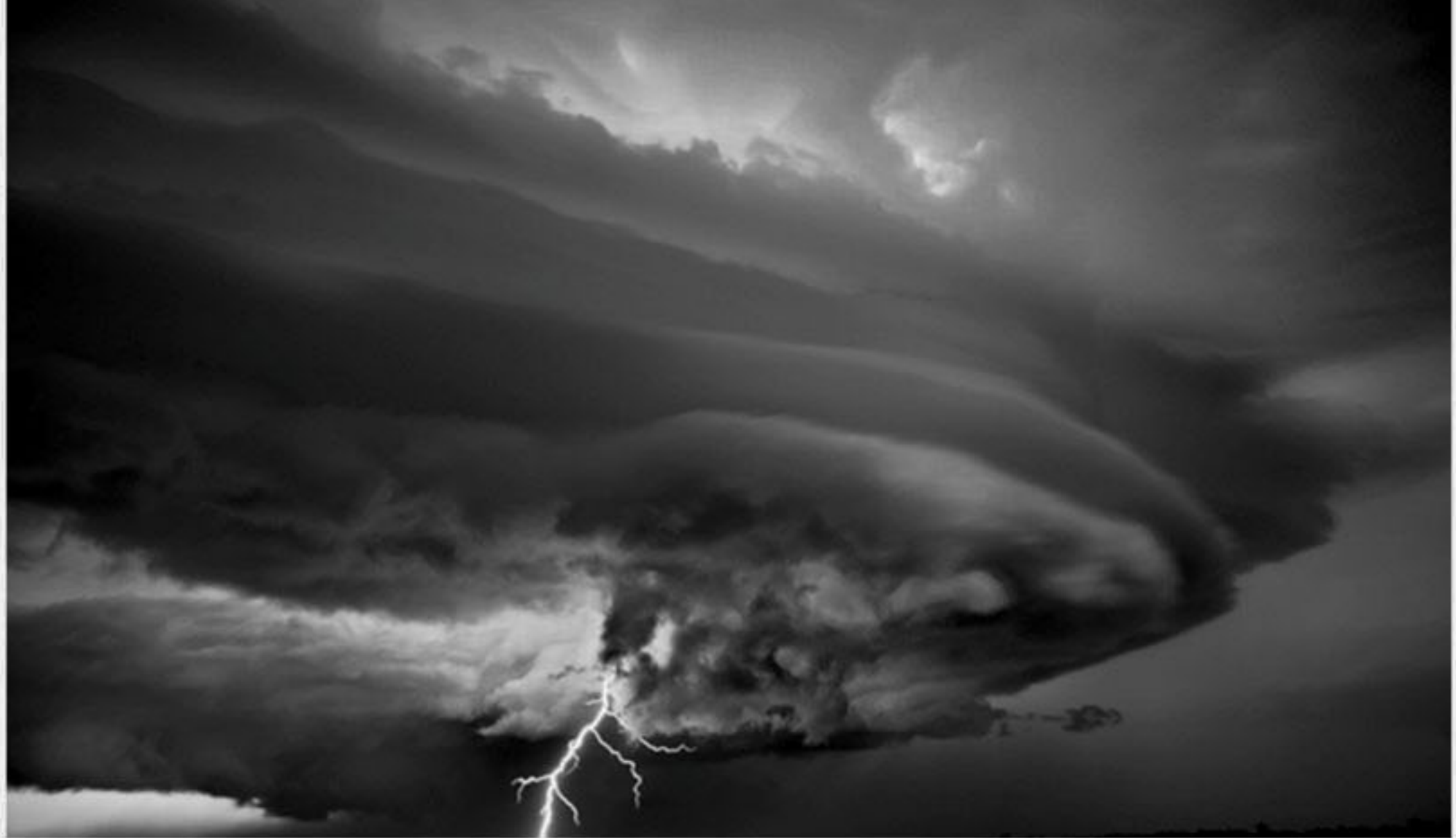
"Jupiter", taken at Mobridge, South Dakota (USA); 2011.