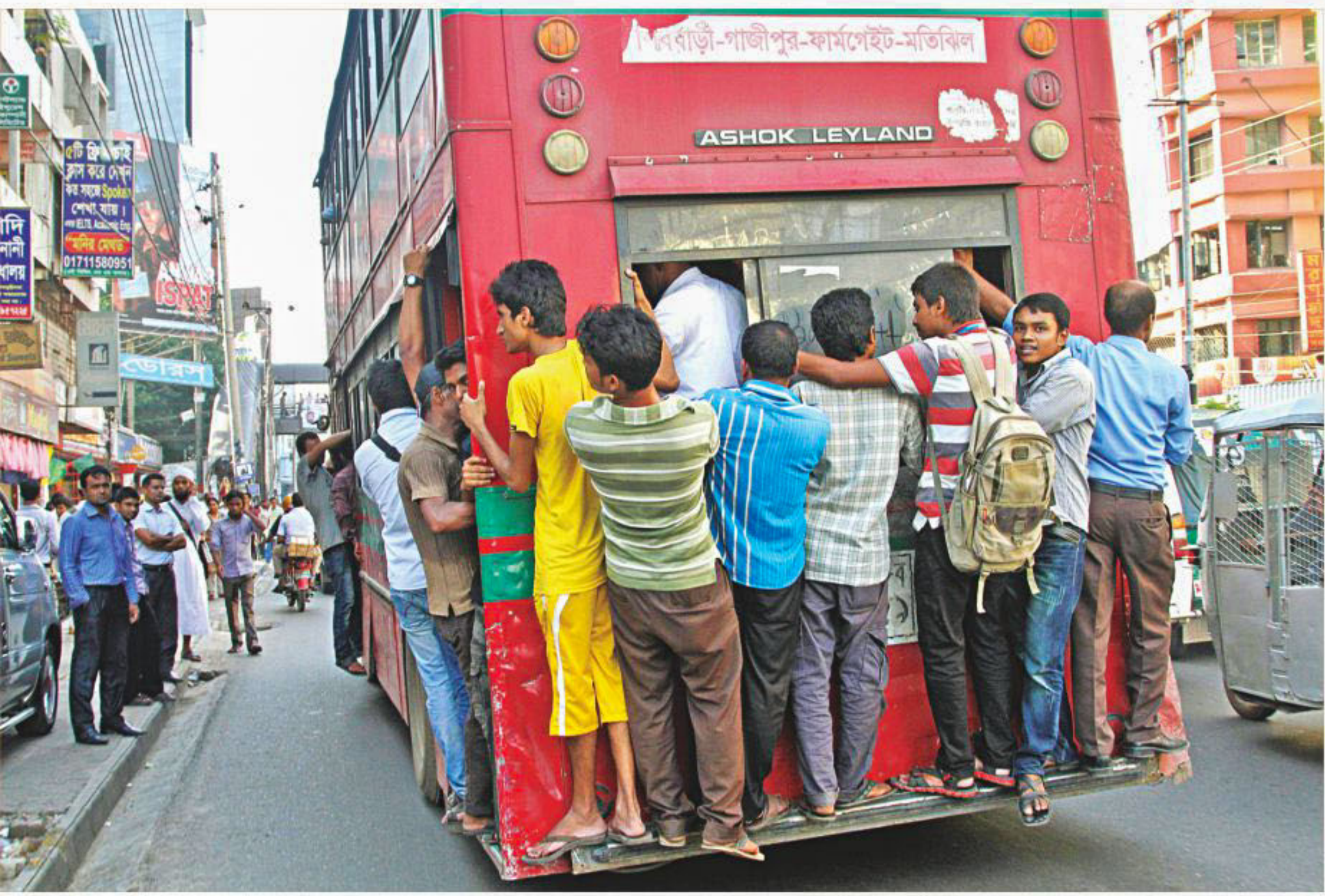
To get home on time for iftar, commuters, at a risk to their lives, hang on to the rear end of an overcrowded bus on Kazi Nazrul Islam Avenue in the capital yesterday, due to the severe dearth of public transports that has been plaguing the city for years.