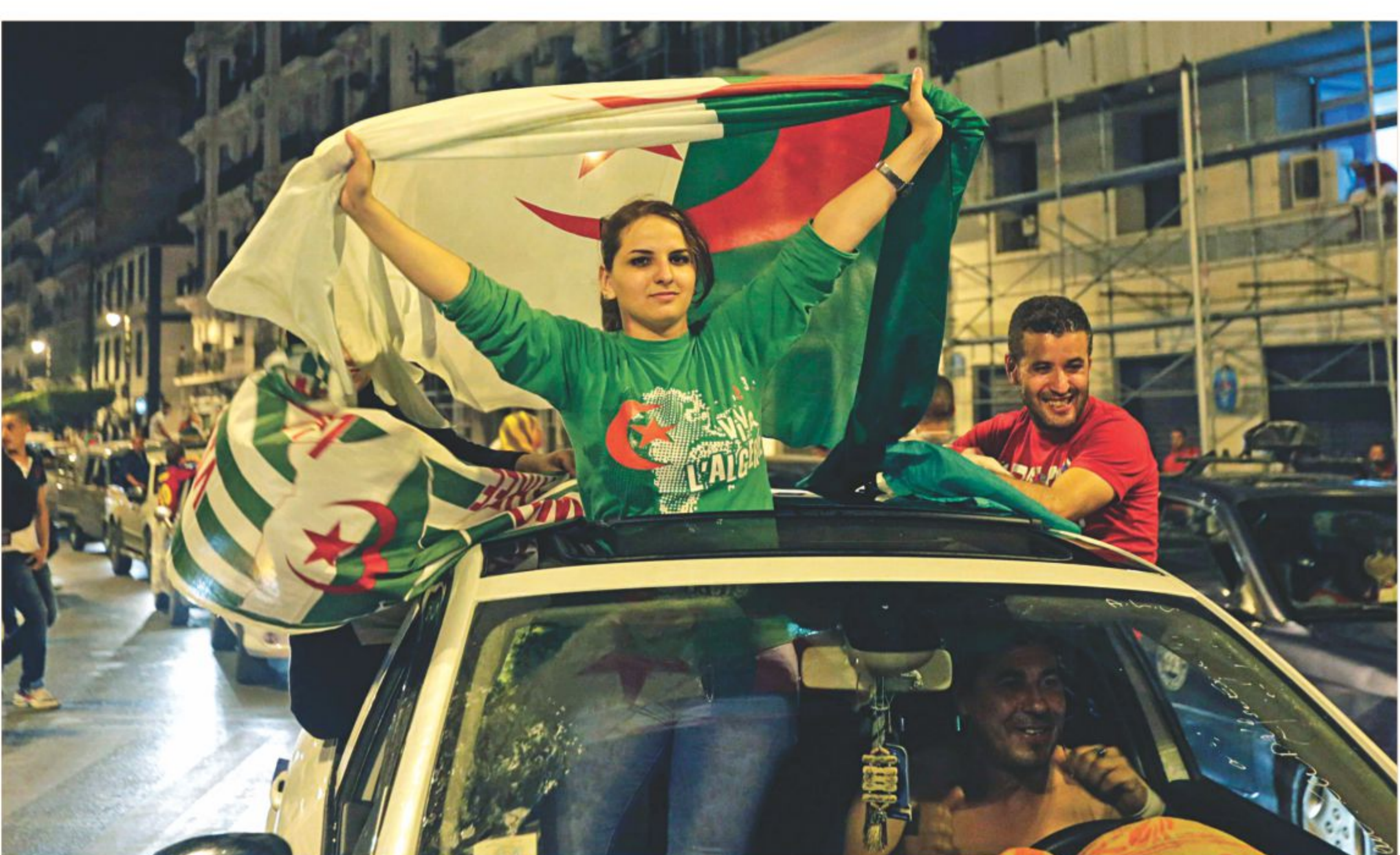
Algiers erupts ... Algerian fans, holding national flags, drive through the streets of the capital late into the night after their country defeated Russia on Thursday to qualify for the final 16 of the World Cup.