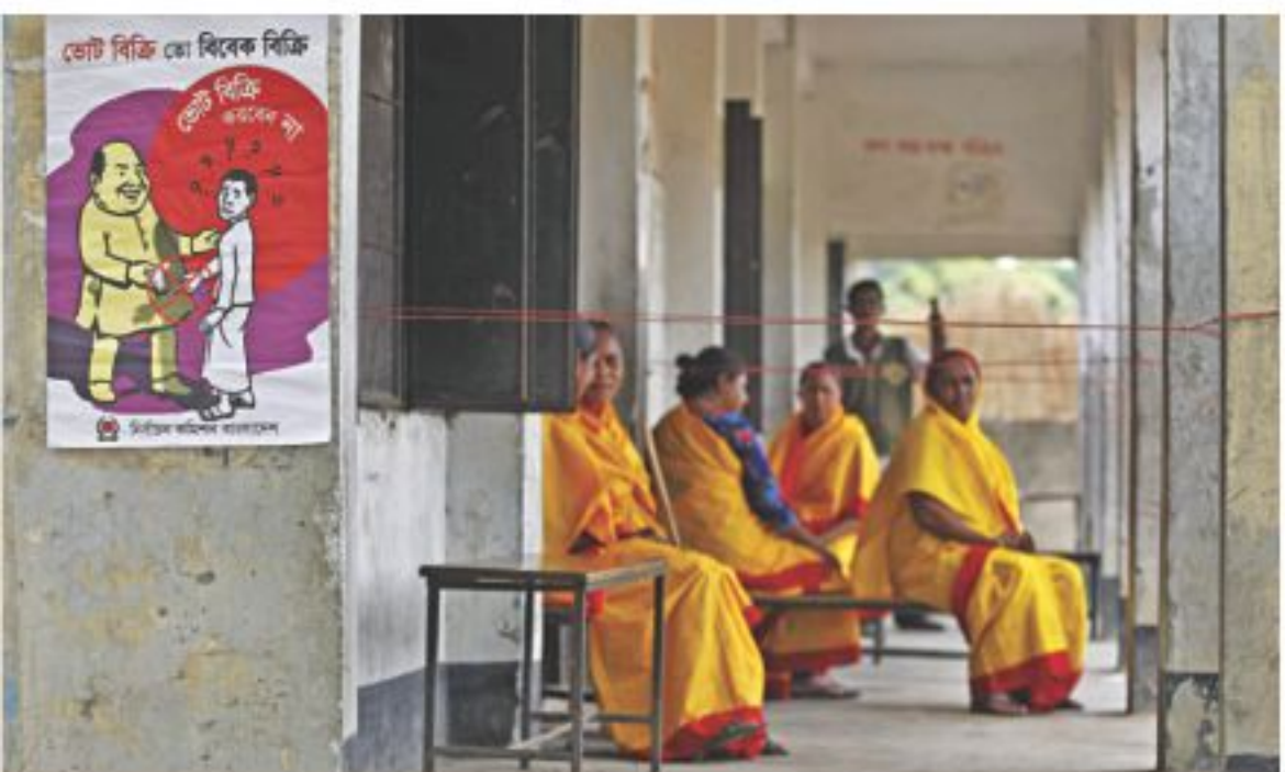
A voter-less polling centre in Bandar of Narayanganj around 3:00pm yesterday.

Low-turnout marks 'peacefully managed' by-polls