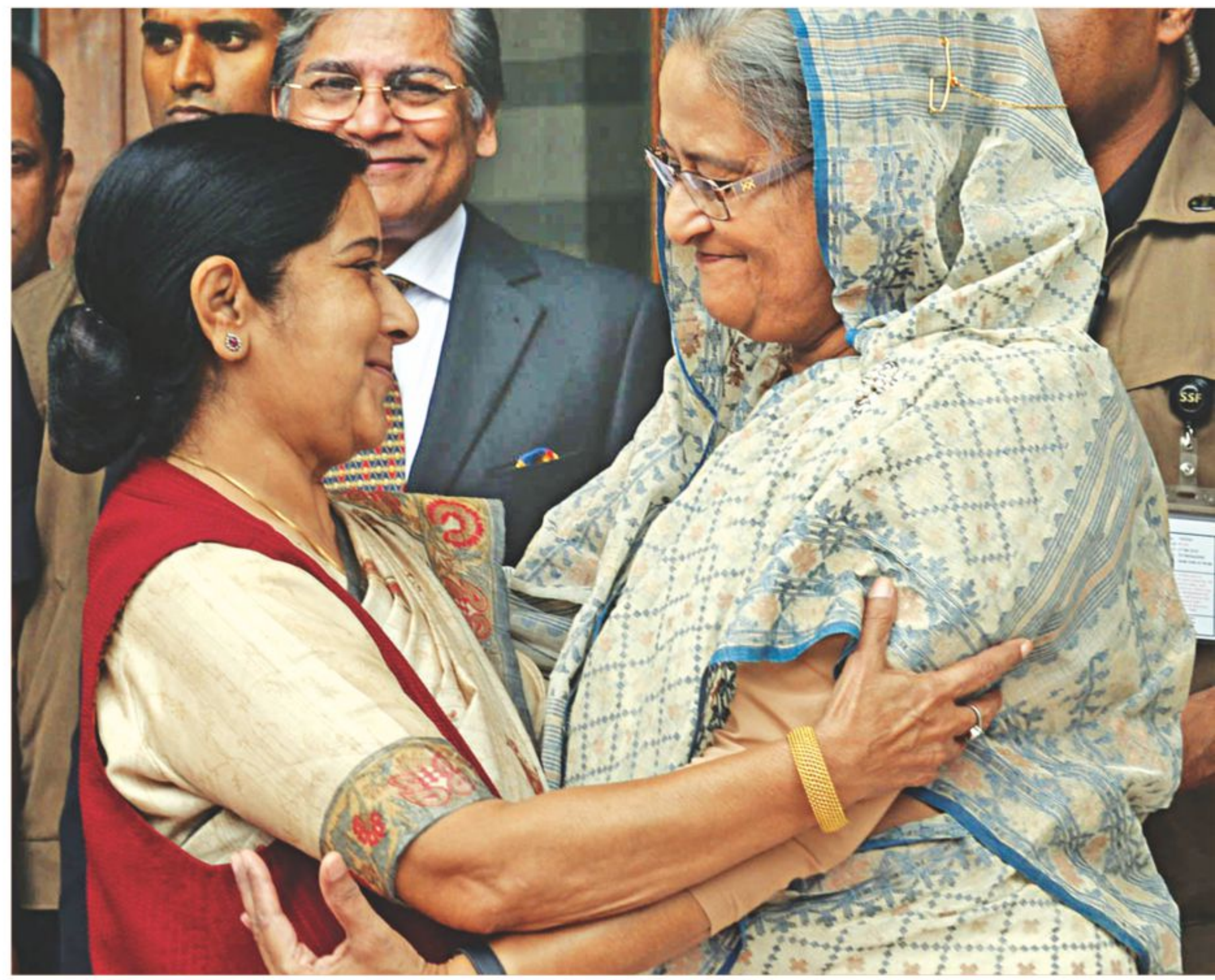
POWER WOMEN: Visiting Indian External Affairs Minister Sushma Swaraj and Prime Minister Sheikh Hasina at the Prime Minister's Office yesterday when Swaraj came calling.