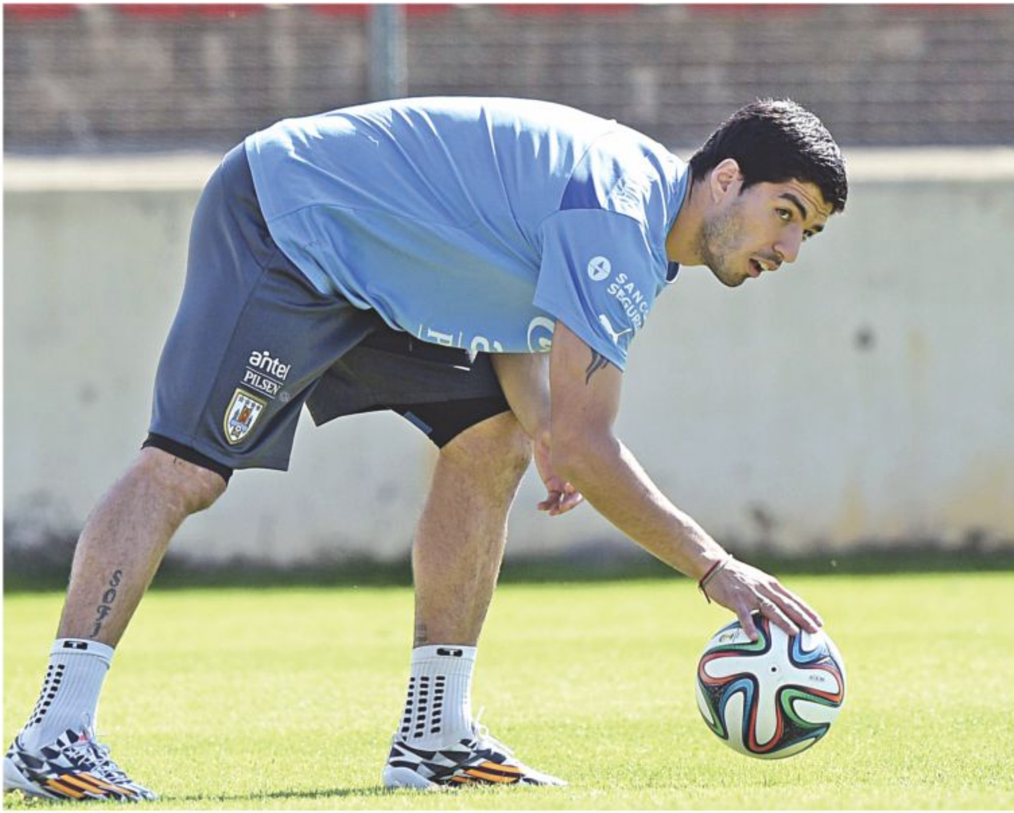
I shoot, you stop ... Uruguay forward Luis Suarez (L) and Italy goalkeeper Gianluigi Buffon during their respective training sessions for today's crunch Group D match.