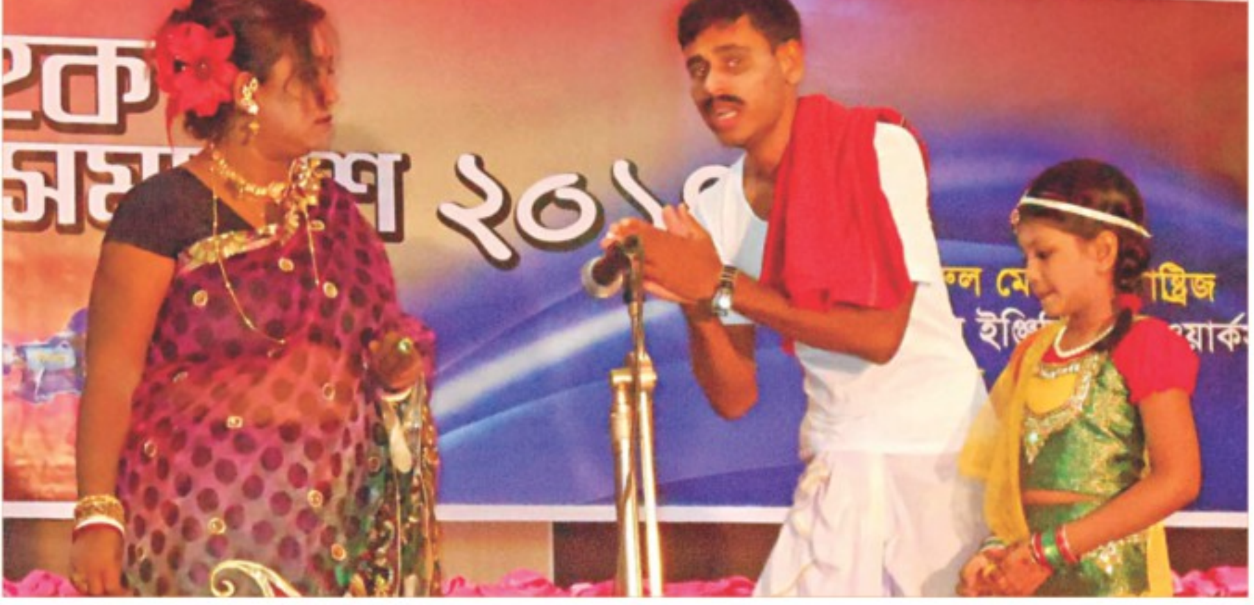
Artistes of Anushilon '95 on stage.