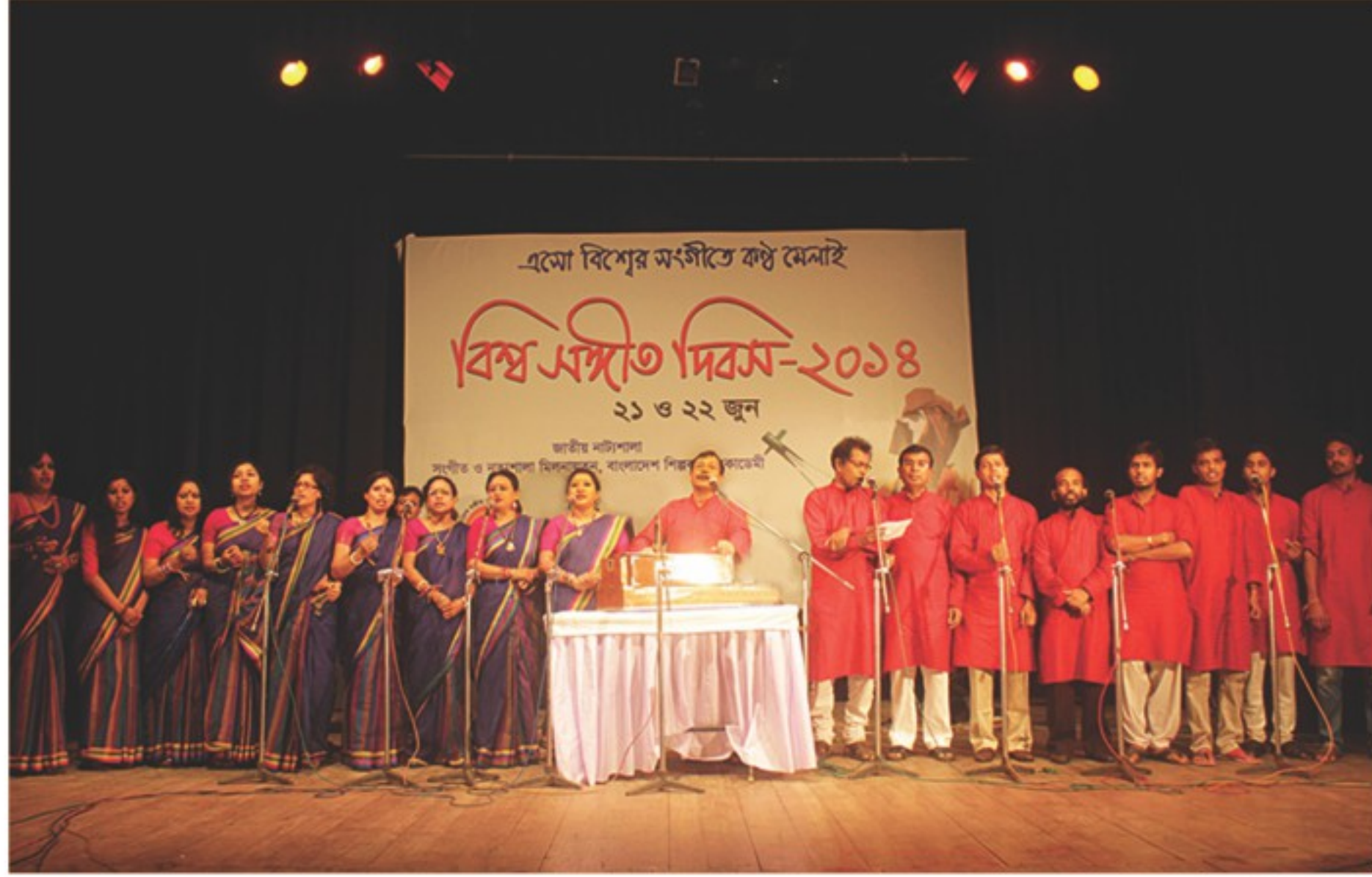
Artistes render a chorus.