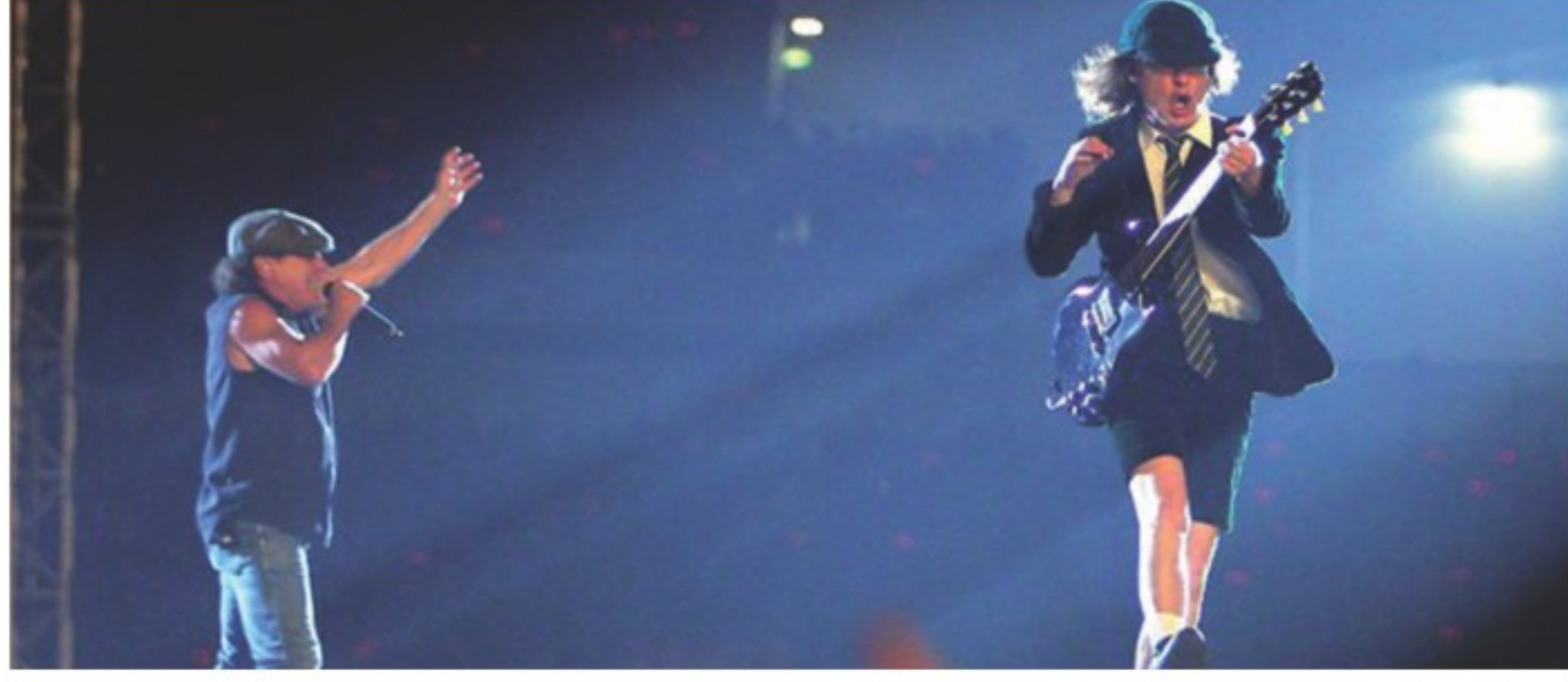
Brian Singer and Angus Young at the Black Ice tour.