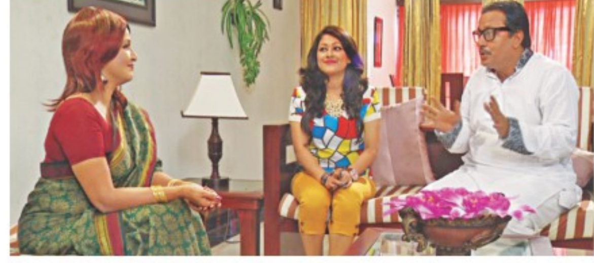
A still from the serial.

The plot revolves around the family of Gulam Ali Mirza, a dominating and selfish family head. No member in his family can freely express their opinion; rather they only flatter their father due to his dictatorial family rules.