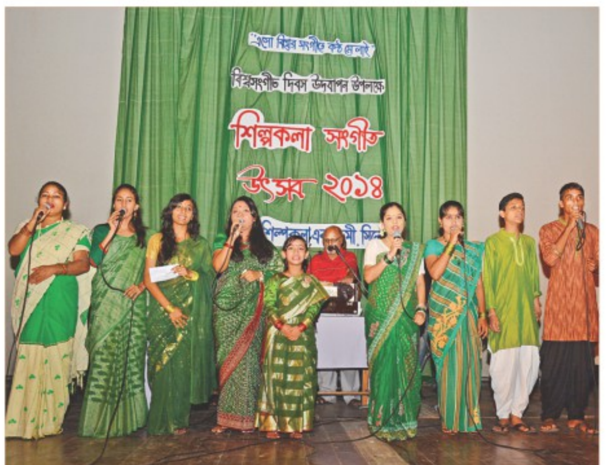
A chorus performance at the event.