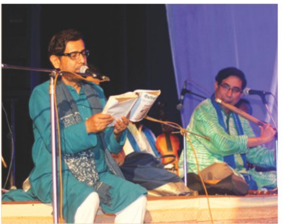
Asaduzzaman Noor recites; artistes perform a choral song.

Cultural Affairs Minister Asaduzzaman Noor, graced the occasion as chief guest