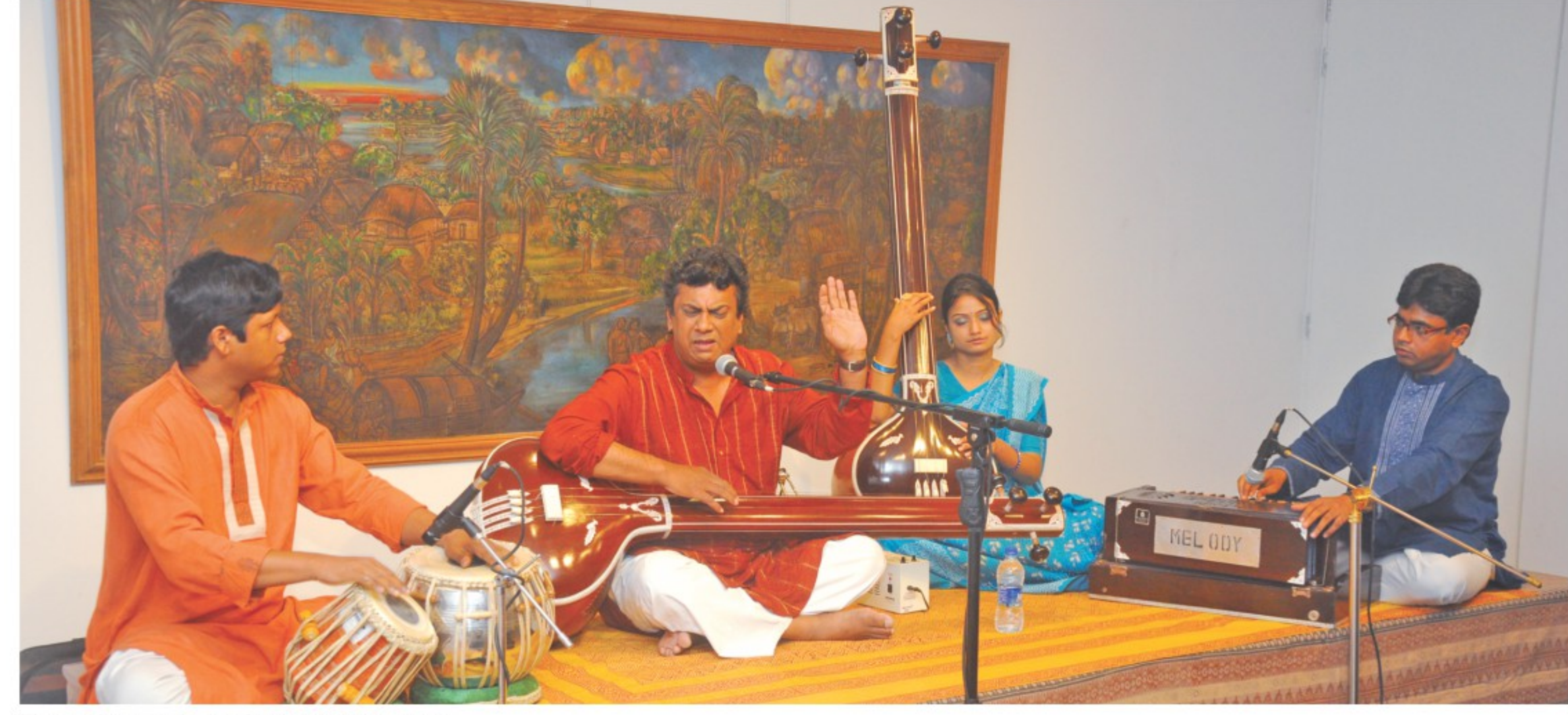
The artiste (2-L) performs at the event.