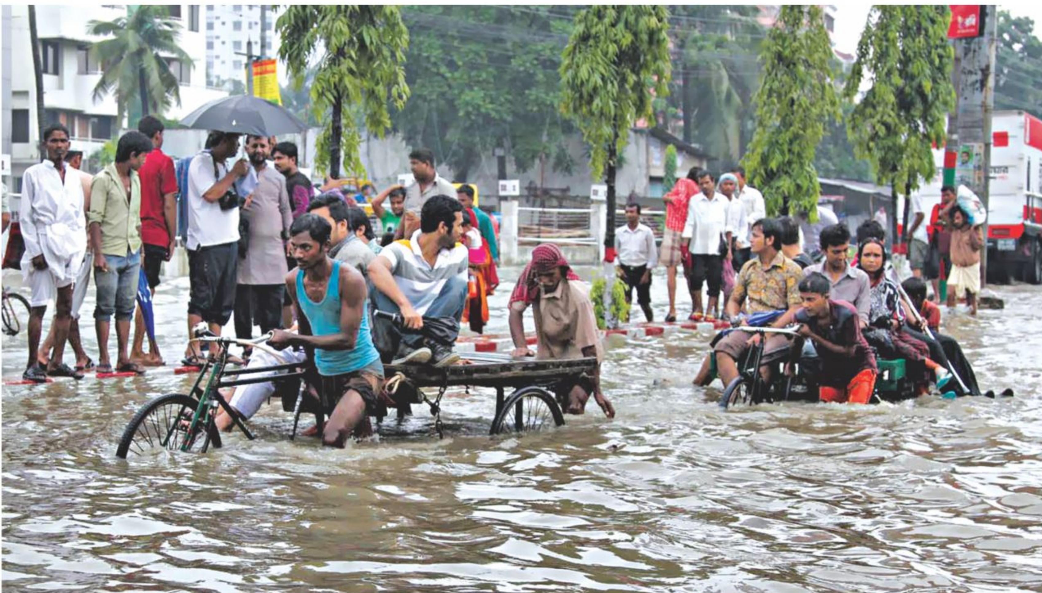
People try to get to work on rickshaw vans ploughing through over knee-deep water on a street in Muradnagar of Chittagong yesterday as overnight heavy showers that stopped around 10:00am inundate several areas of the port city.