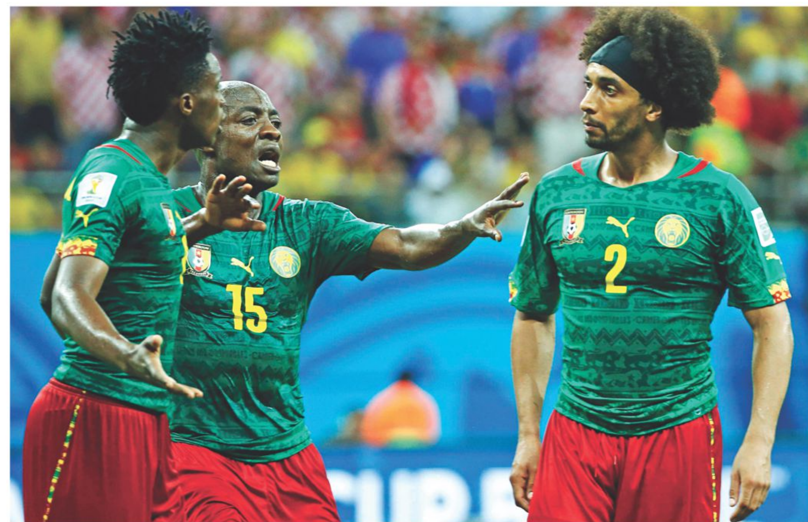
Football players clashing on the field is nothing new, but what's unique in this picture is the men in question belong to the same team -- Cameroon.

"He loves football but his body is the most important thing for him, to be fit, to be healthy so if he starts the match it's because he's ready, he's fit."