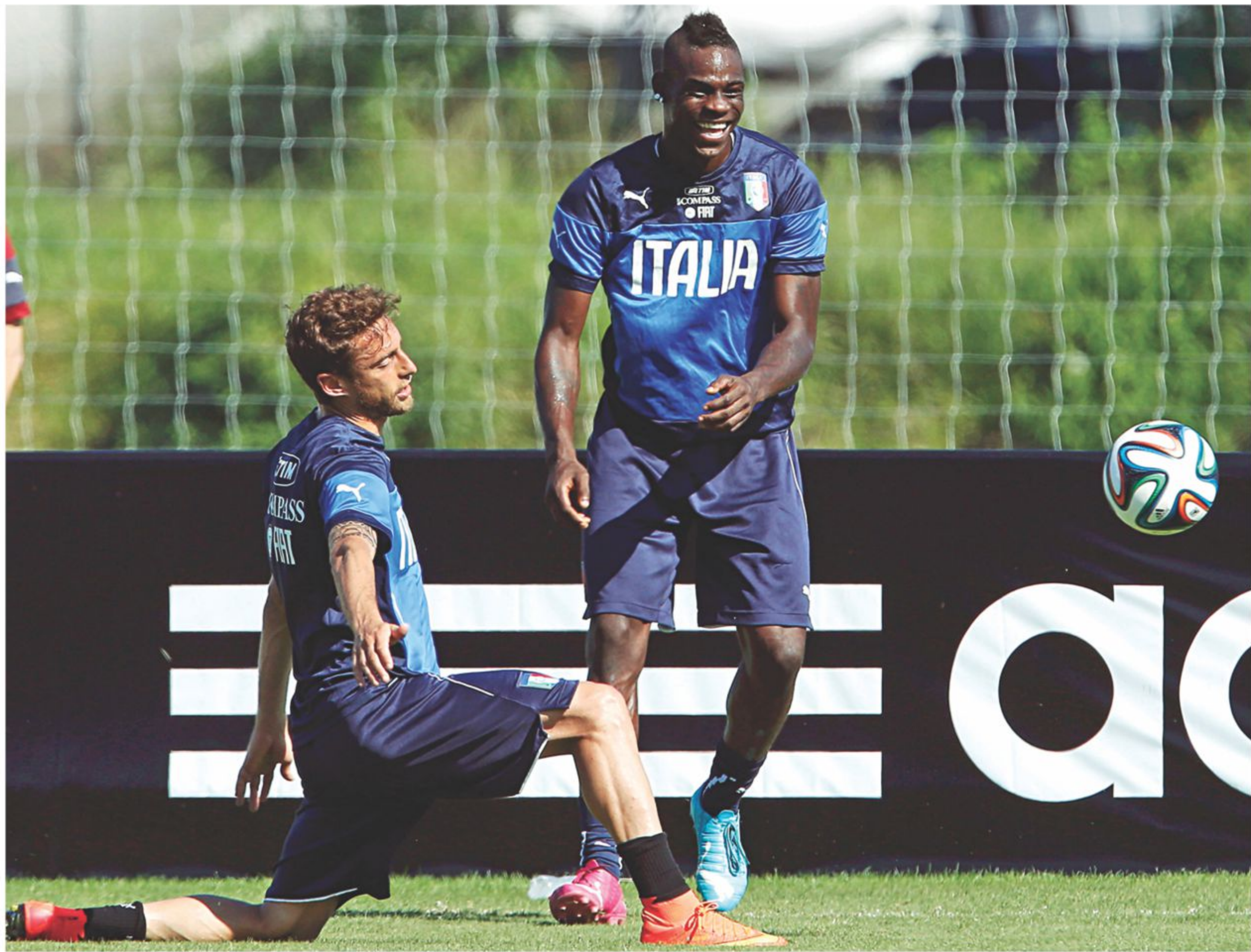
Italy's lone man up front Mario Balotelli (R) smiles during practice session in Mangaratiba on Tuesday. Azzurri fans wait to see if he can hold this smile today.

"The last time we'll see Tim Cahill at a World Cup. Thank you, now without a shadow of a doubt, our greatest ever," said another. He is also renowned for being down-to-earth, especially when meeting fans of all ages, and is always happy to give autographs and chat to people.