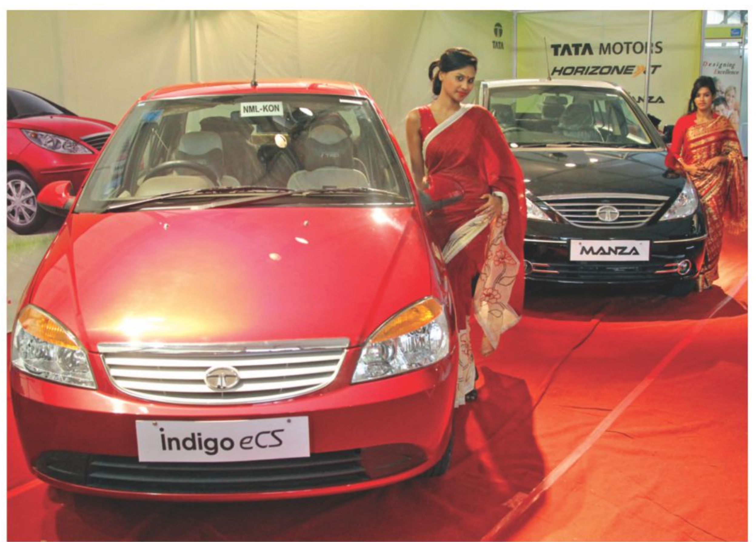
Nitol Motors, the local distributor of Tata vehicles, showcases Indigo ECS and Manza cars at the Asian International Trade Expo that kicked off at Bangabandhu International Conference Centre in Dhaka yesterday. The five-day trade fair organised by Conference and Exhibition Management Services Ltd has opened an opportunity for both local and foreign brands to showcase their services and products.