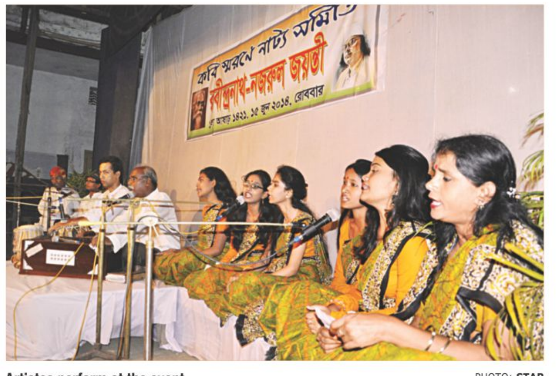
Artistes perform at the event.