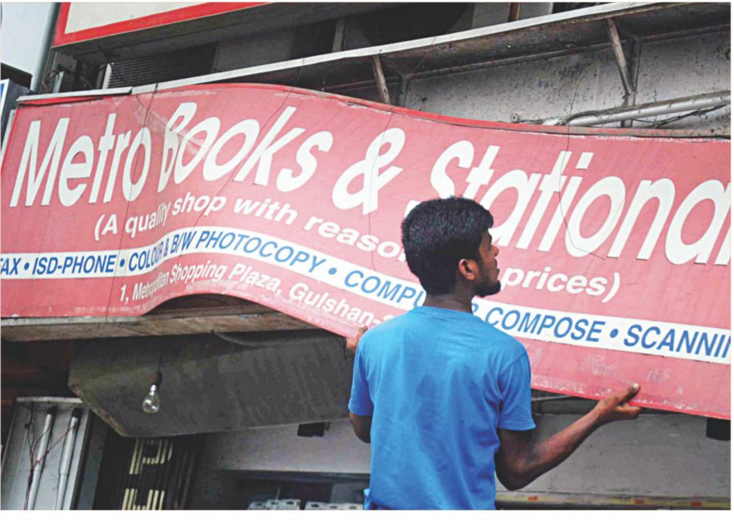
Dhaka North City Corporation brings down a signboard with English writing in the capital's Gulshan yesterday, in accordance with a High Court order that allows only the use of Bangla in all advertisements of electronic media, vehicles registration plates and hoardings of the country.