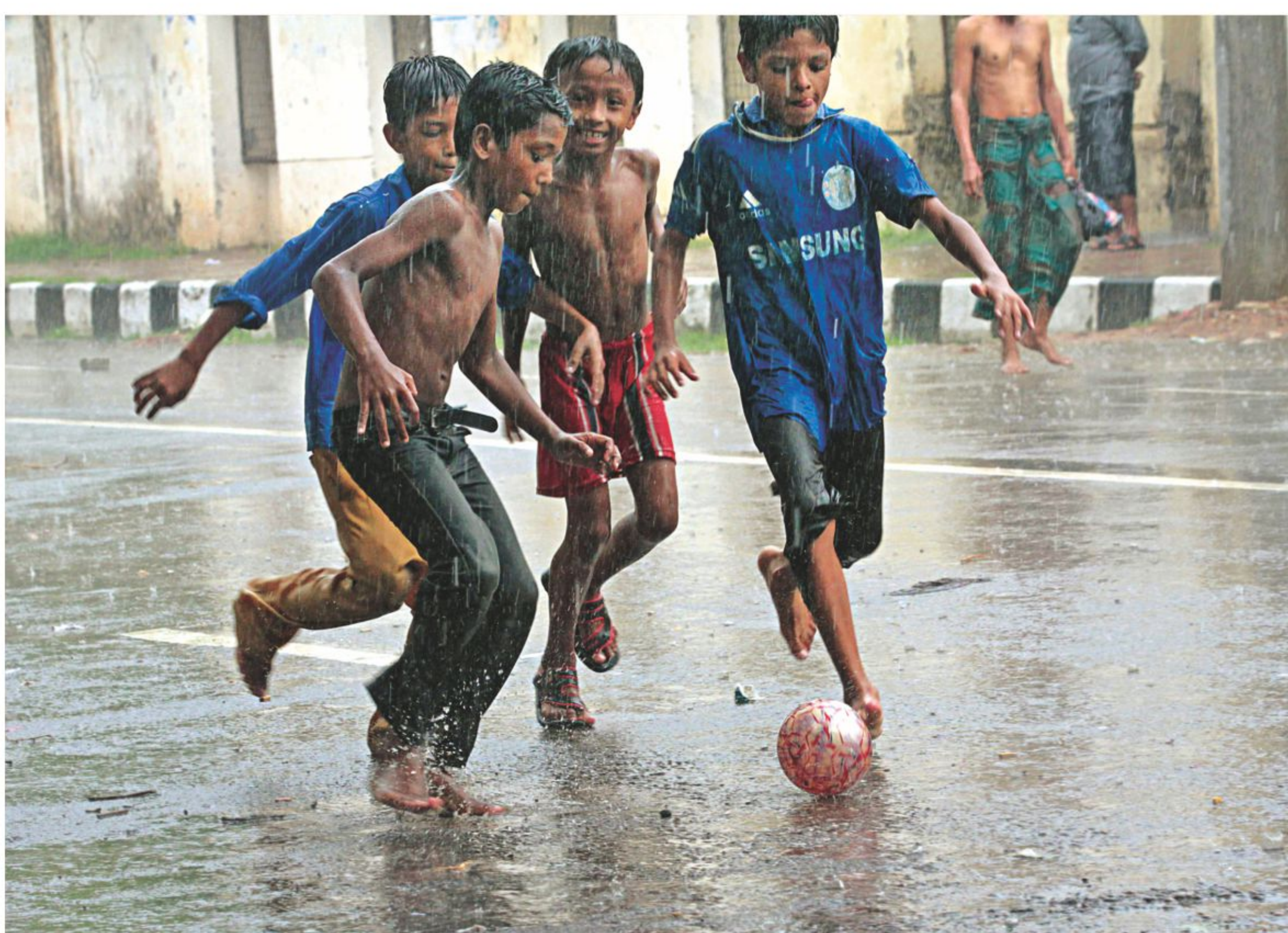
The world may be focused on Brazil as football giants take on each other for glory but for some playing skins versus shirts in pouring rain on the street is a lot more fun. The photo was taken from Tejgaon Industrial Area in the capital yesterday.