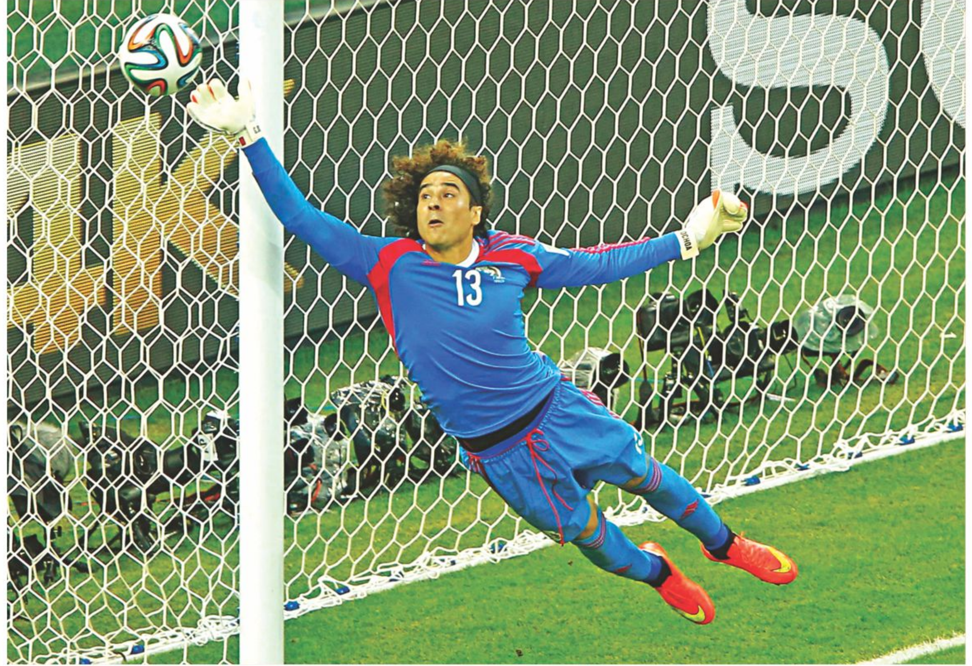
Mexico goalkeeper Guillermo Ochoa dives to save a scorching header from Brazil's Neymar, which was only one of his many incredible saves in yesterday's match in Fortaleza that ended 0-0.