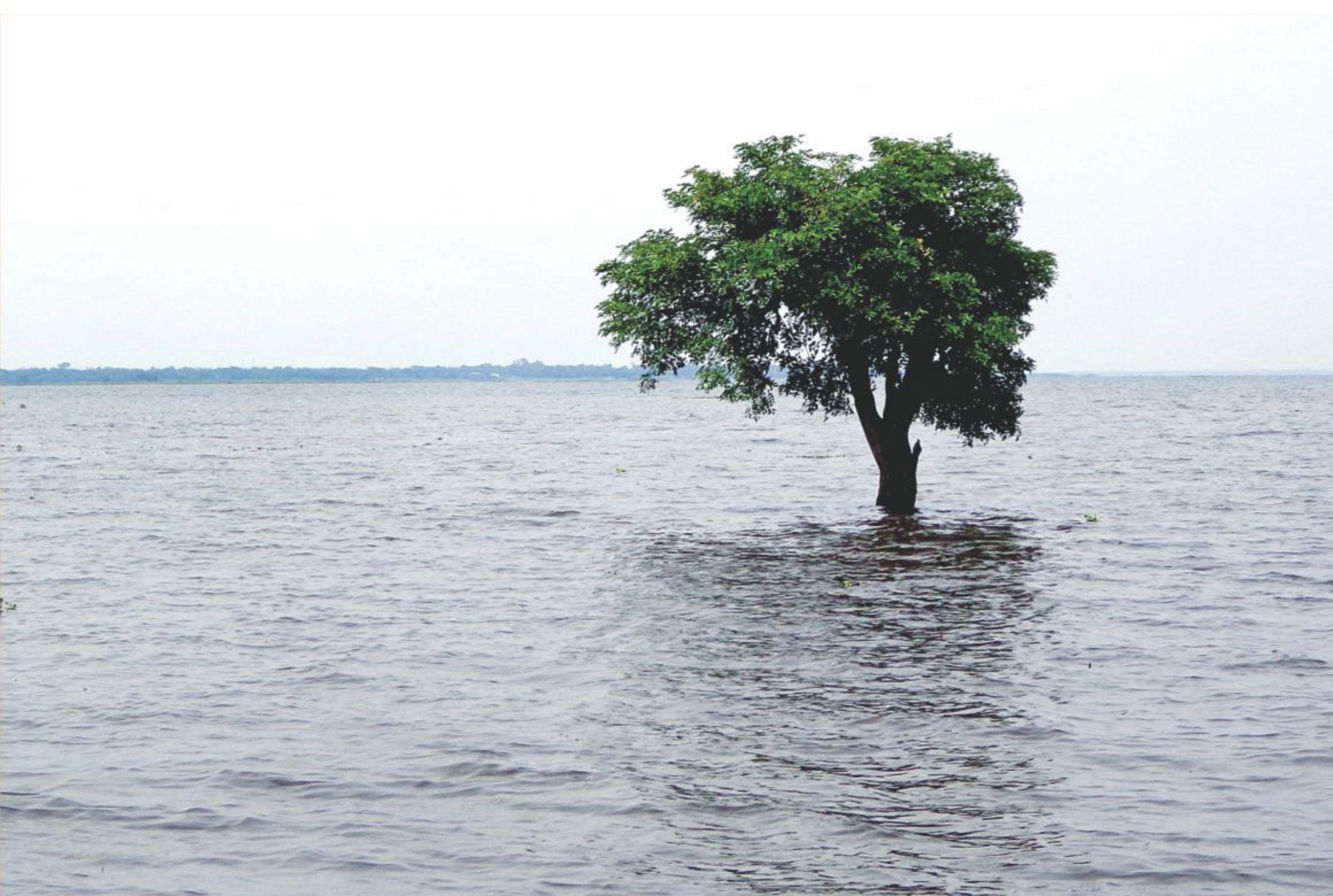
A vast haor in Sunamganj brimming with water beside Sylhet-Sunamganj highway on Friday, the eve of the official start of monsoon yesterday.