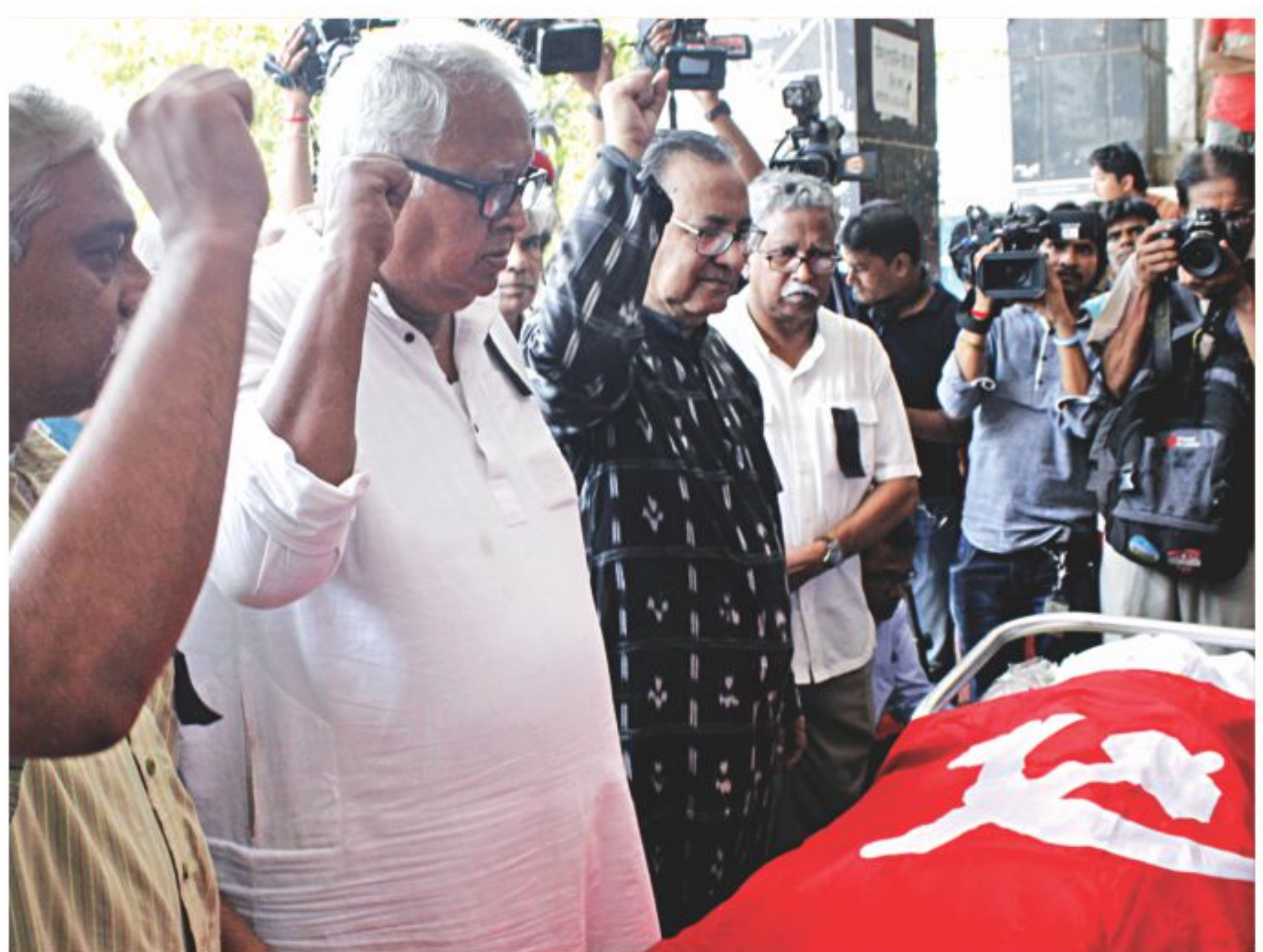
Leaders of the Communist Party of Bangladesh salute the coffin of scholar and philosopher Sardar Fazlul Karim at the party office in the capital yesterday. Sardar died early yesterday.