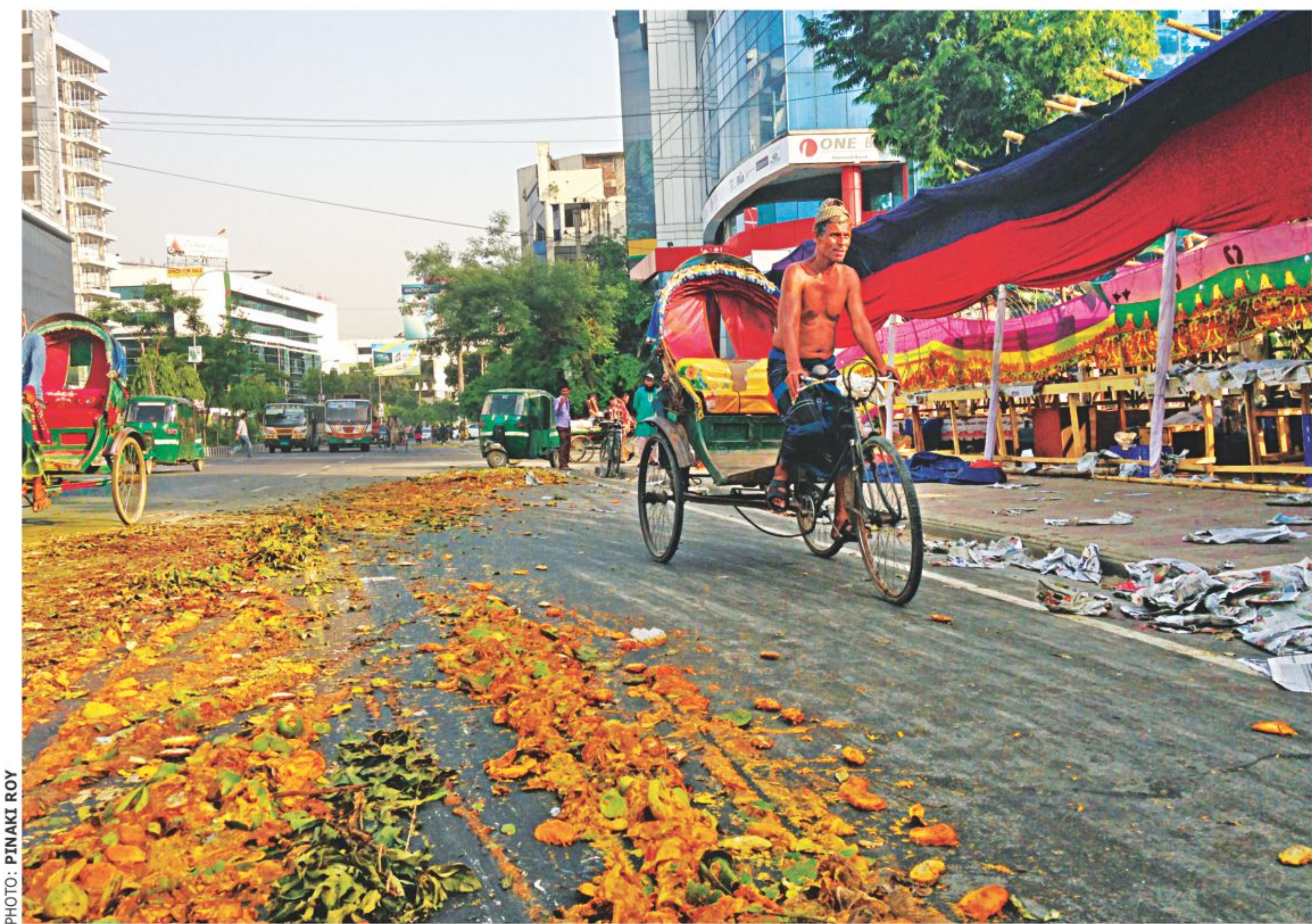
Crushed mangoes litter Mirpur Road at Kalabagan in the capital yesterday afternoon after a mobile court destroyed the chemical-tainted mangoes by running them over with a truck. Roadside shops there, on the right, were selling the mangoes, claiming them to be chemical-free.