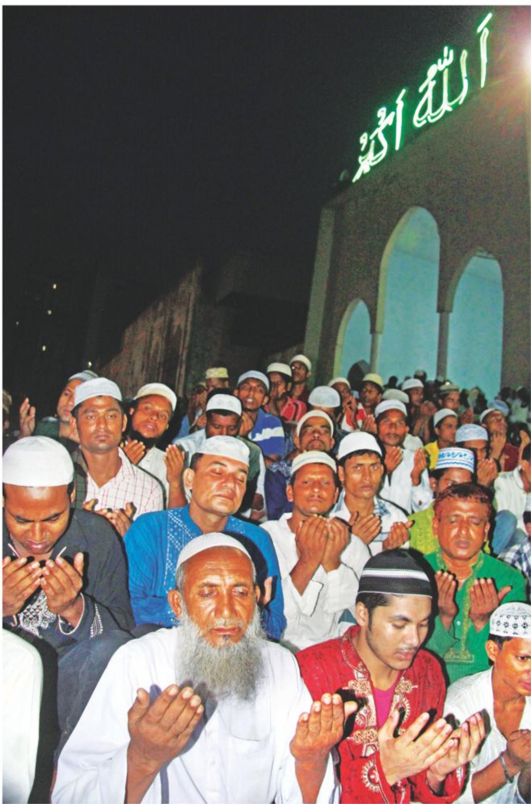
Muslims offer special prayers at Baitul Mukarram Mosque in the capital on Shab-e-Barat early yesterday.