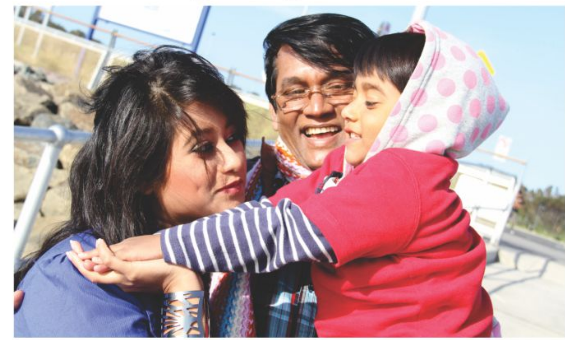
SHAH ALAM SHAZU

Fathers are said to be every person's 'first hero'. Father's Day, celebrated most commonly on the third Sunday of June, is an occasion for all sons and daughters to show their love and gratitude to their father, and also for fathers to think back about what being a father means to them. The Daily Star caught up with three loving fathers who are popular names in the country's entertainment industry, on what fatherhood and their children mean to them.