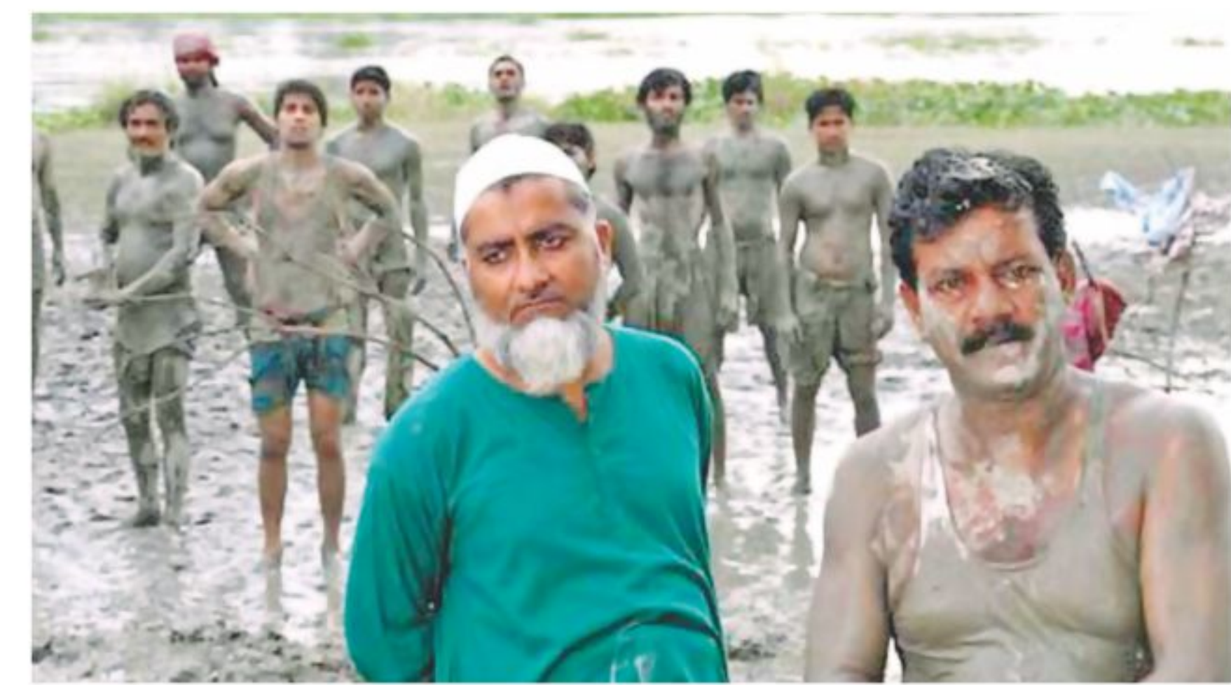
A still from "Jibondhuli".