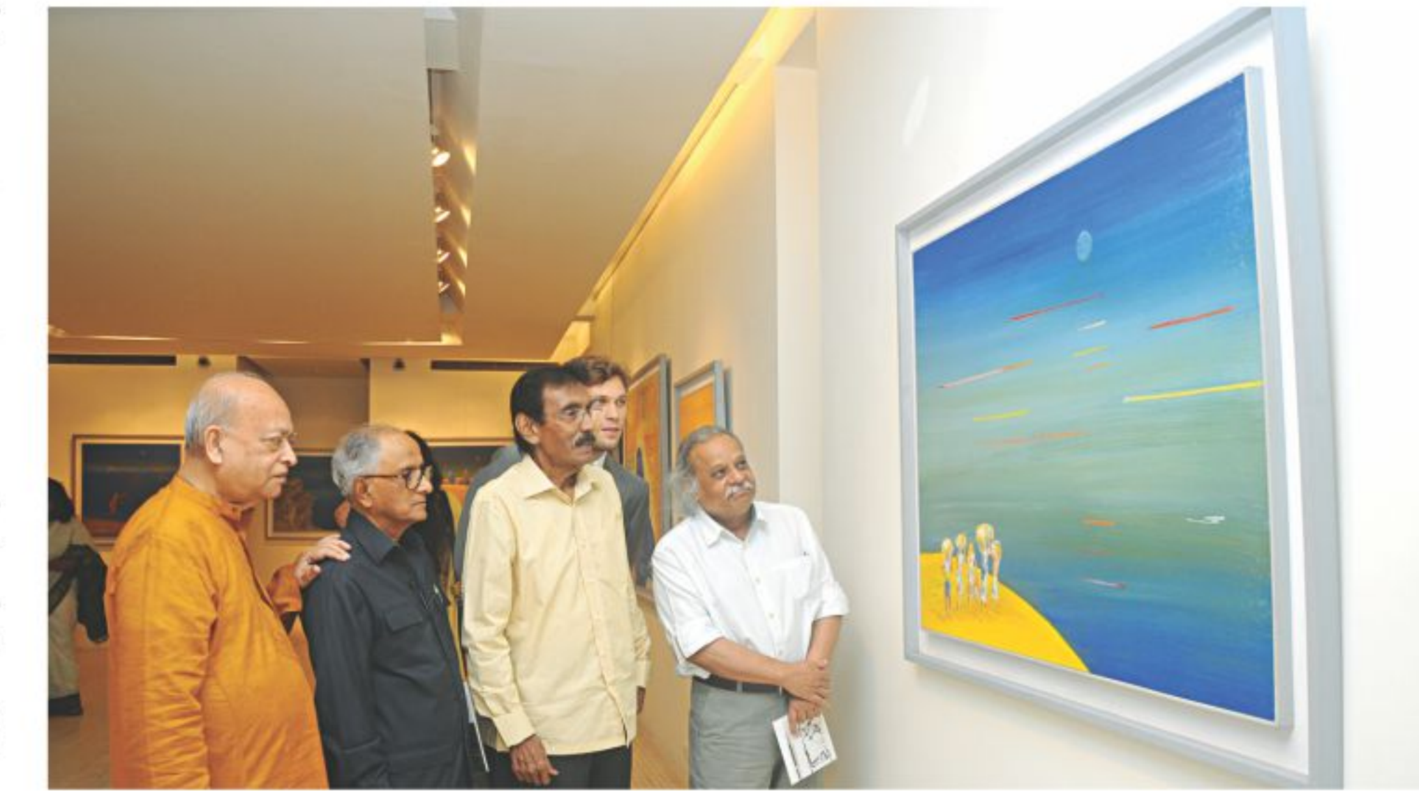
Guests and the artist at the exhibition.

At the exhibition, most of his acrylics and