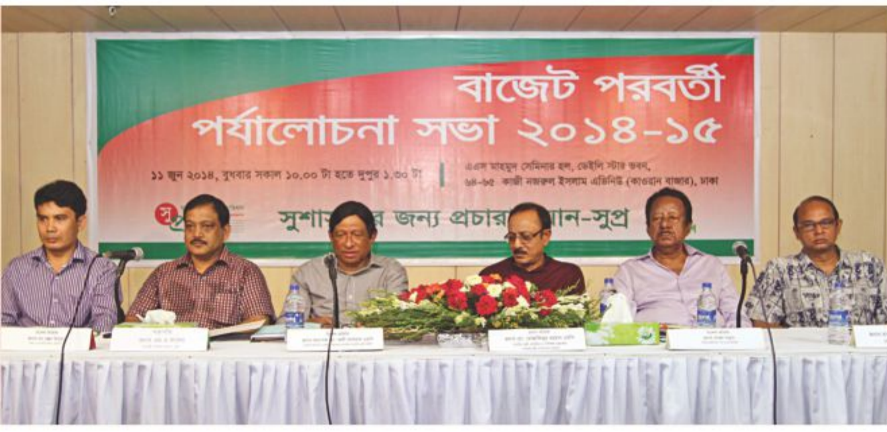
Analysts attend a budget discussion co-organised by Sushashoner Jonno Procharavizan and Oxfam at The Daily Star Centre yesterday.