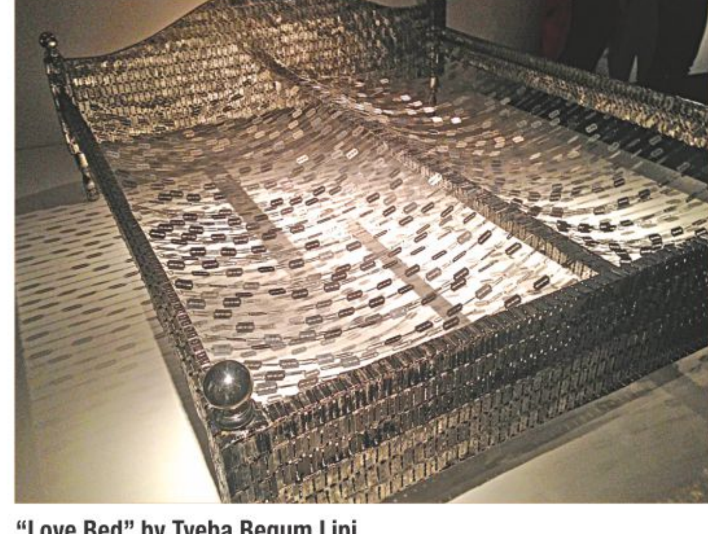
"Love Bed" by Tyeba Begum Lipi.

Due, in part, perhaps to the fact that the prominence and visibility of the Venice Biennale had not been particularly evident to everyone, in 2011 the Britto group had organised its participation, without any excessive external pressure, and without other artists trying to gain access to the Bangladesh Pavilion. But in 2013 things were not so simple. An excessively large, and above all heterogeneous, number of artists were invited to participate. Some tried to elbow their way in, others declined the invitation, but the end result was very mixed, and basically reflected the pattern of many exhibitions that are staged in Dhaka: 10 walls available, 20 invited artists, with 3 works each. Nothing could be more distant from the spirit of the Venice Biennale. The vast majority of the countries taking part in the Venice Biennale send one artist to their Pavilion, who is given the task of setting out the whole area. Sometimes