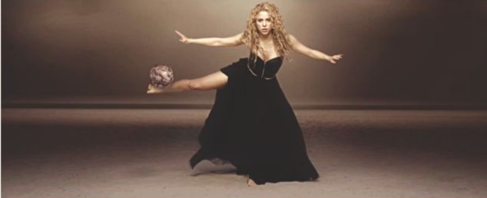
Shakira's "La la la" has been one of the top favourites of the tournament.

Shakira follows up her official song for the 2010 World Cup, "Waka Waka