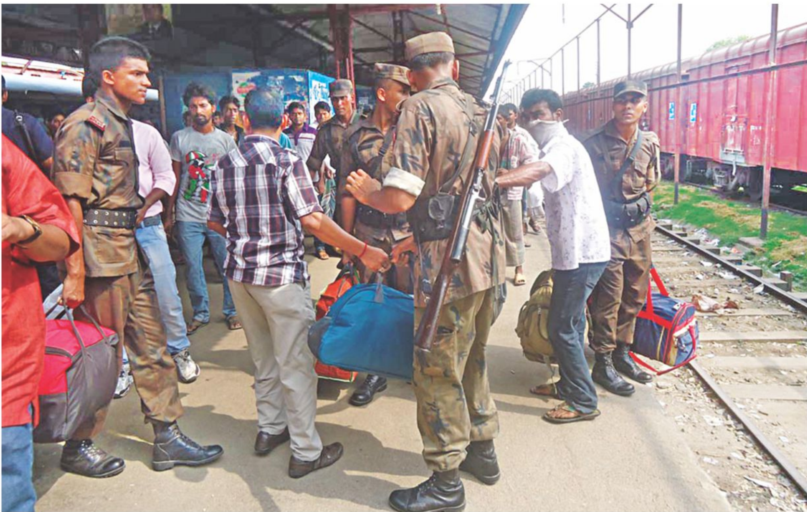
Border Guard Bangladesh personnel checking luggage of passengers of Maitree Express, heading towards Dhaka from Kolkata, at Ishwardi Railway Station, came under attack by reportedly smugglers yesterday. The photo shows a man hiding his face in confrontation with a BGB personnel yesterday.