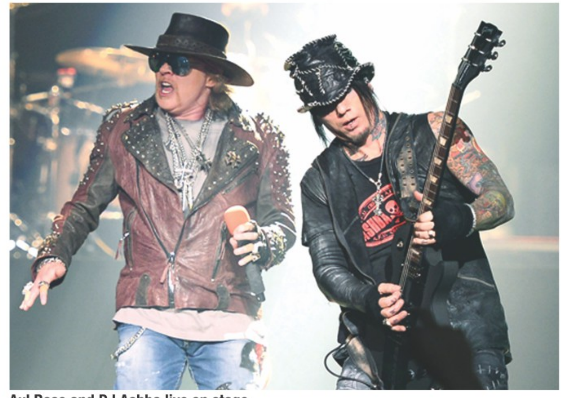
Axl Rose and DJ Ashba live on stage.

Guns N' Roses may be in the middle of a new residency in Las Vegas, but the band's first Vegas residency that took place back in 2012 forms the basis for a new 3D concert film titled "Appetite for Democracy 3D: Live at the Hard Rock Casino - Las Vegas". Before the disc drops in stores and online, fans will get a chance to see it in movie theatres, as Rock Fuel Media has selected DRK Productions to distribute the theatrical premiere of the concert film. Screenings will take place in 100 cities across the US on June 14. The film includes performances of such longtime GN'R staples as "Welcome to the Jungle", "Paradise City", "Sweet Child O' Mine", "Patience", "Don't Cry", "November Rain" and more. The band also incorporates some of their newer tracks like "This I Love", "Street of Dreams" and the title track from the "Chinese Democracy" album. "Appetite for Democracy 3D: Live From the Hard Rock Casino - Las Vegas" will be released on Blu-Ray on July 1. The offering provides viewers with both 2D and 3D versions, as well as bonus interviews. Source: Loudwire