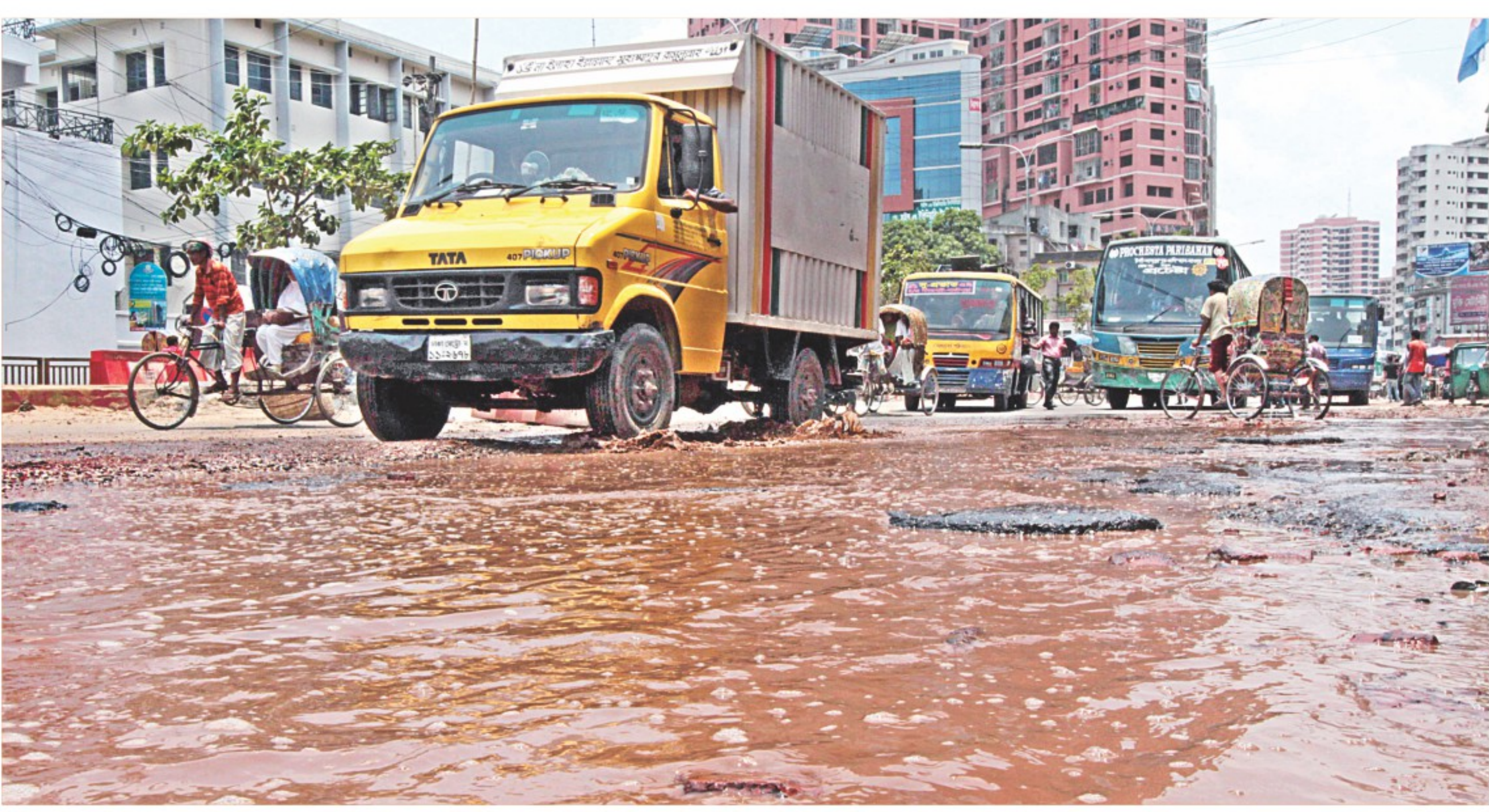
Leaked malodorous sewage has been flooding a section of the road at the capital's Malibagh intersection for a long time now. Constant running of vehicles over it has resulted in creation of large craters, and with the advent of rain these are being filled with the foul-smelling liquid hiding their depths, triggering possibilities of accidents. But nobody seems to care. The photo was taken yesterday.