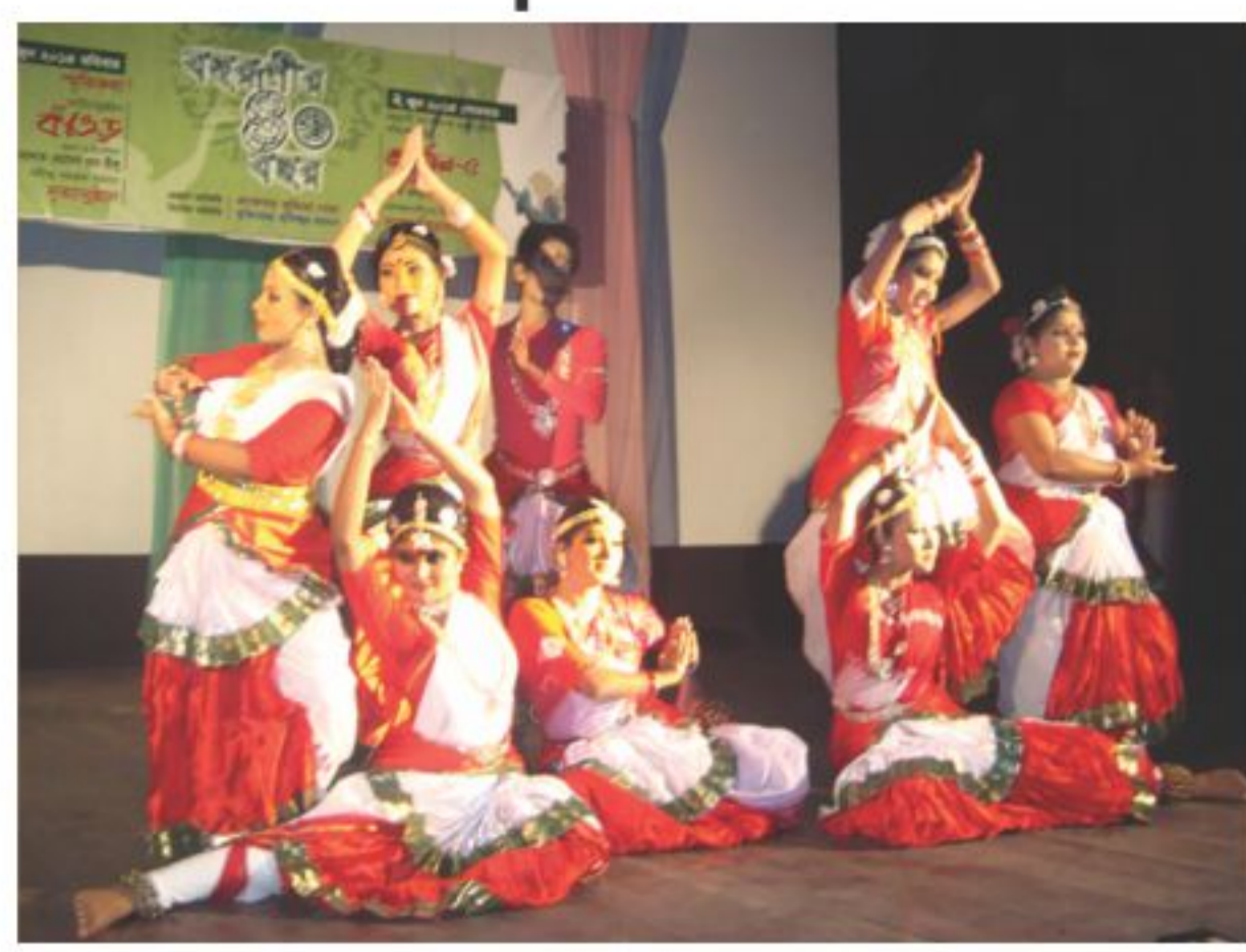
Artistes perform at the event.