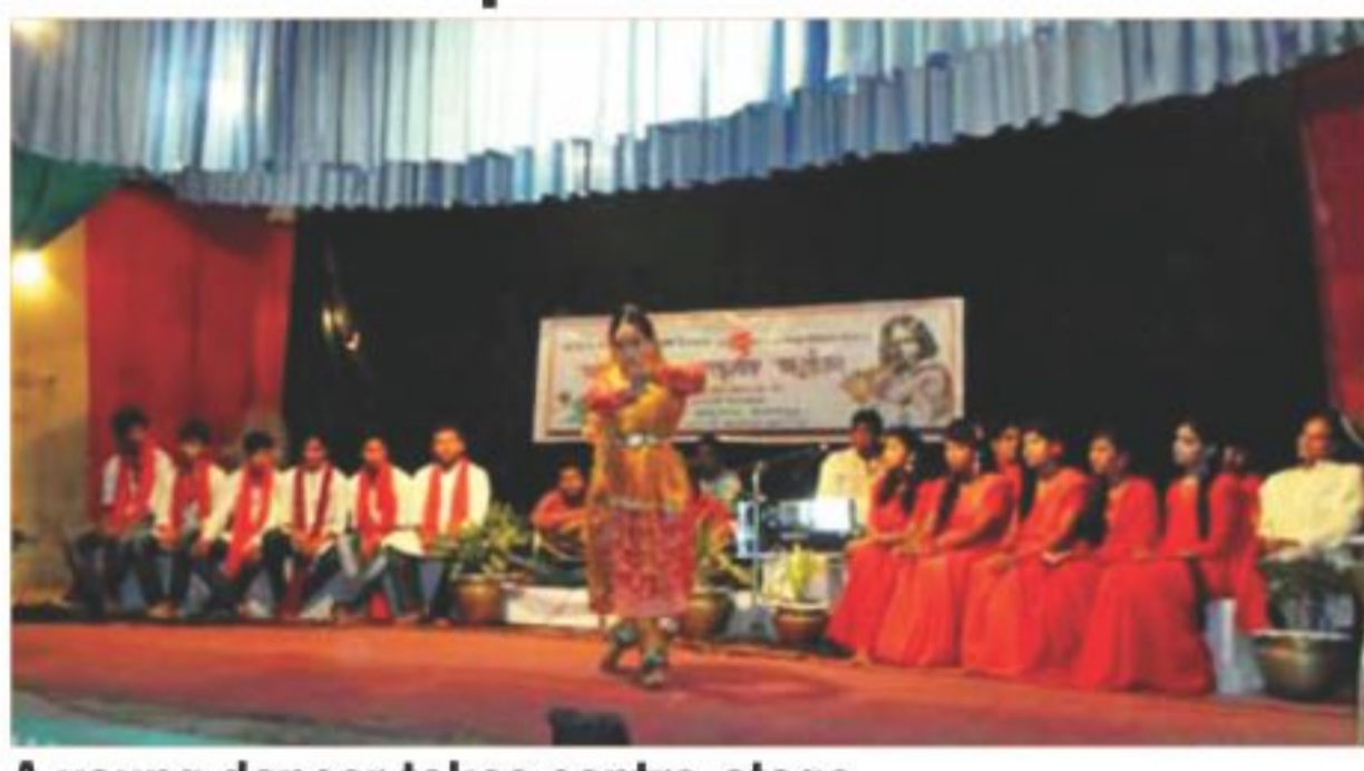
A young dancer takes centre-stage.