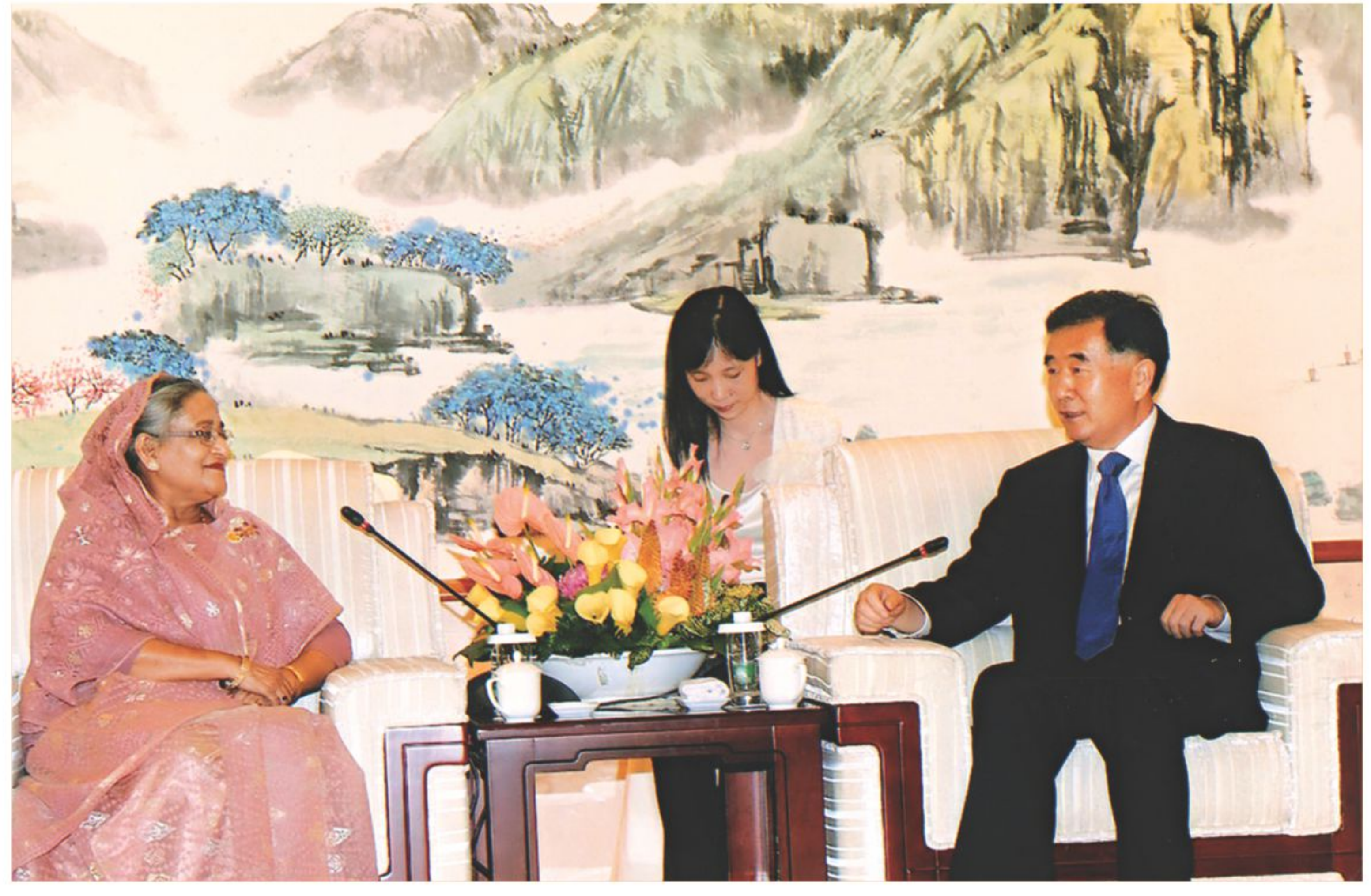
Prime Minister Sheikh Hasina meets Chinese Vice-Premier Wang Yang at Kunming International Convention and Exposition Centre in China yesterday.