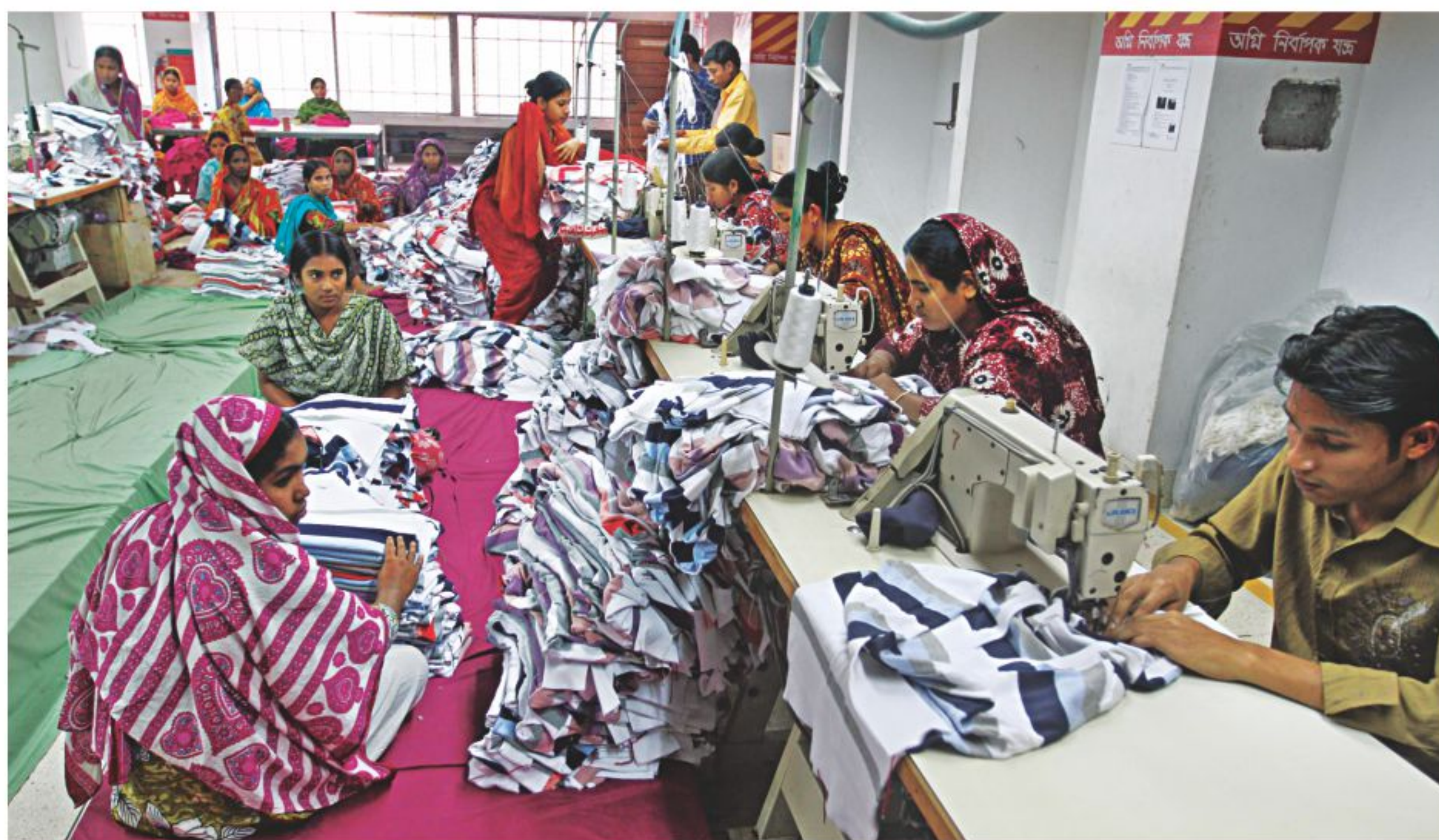
Workers are busy at a garment factory. Apparel exporters have welcomed the government's proposal to offer full duty waiver on imports of building materials and fire safety equipment for the sector.

Political determination is needed to implement such projects. If not, no investor will come forward for a partnership with the government, he said.