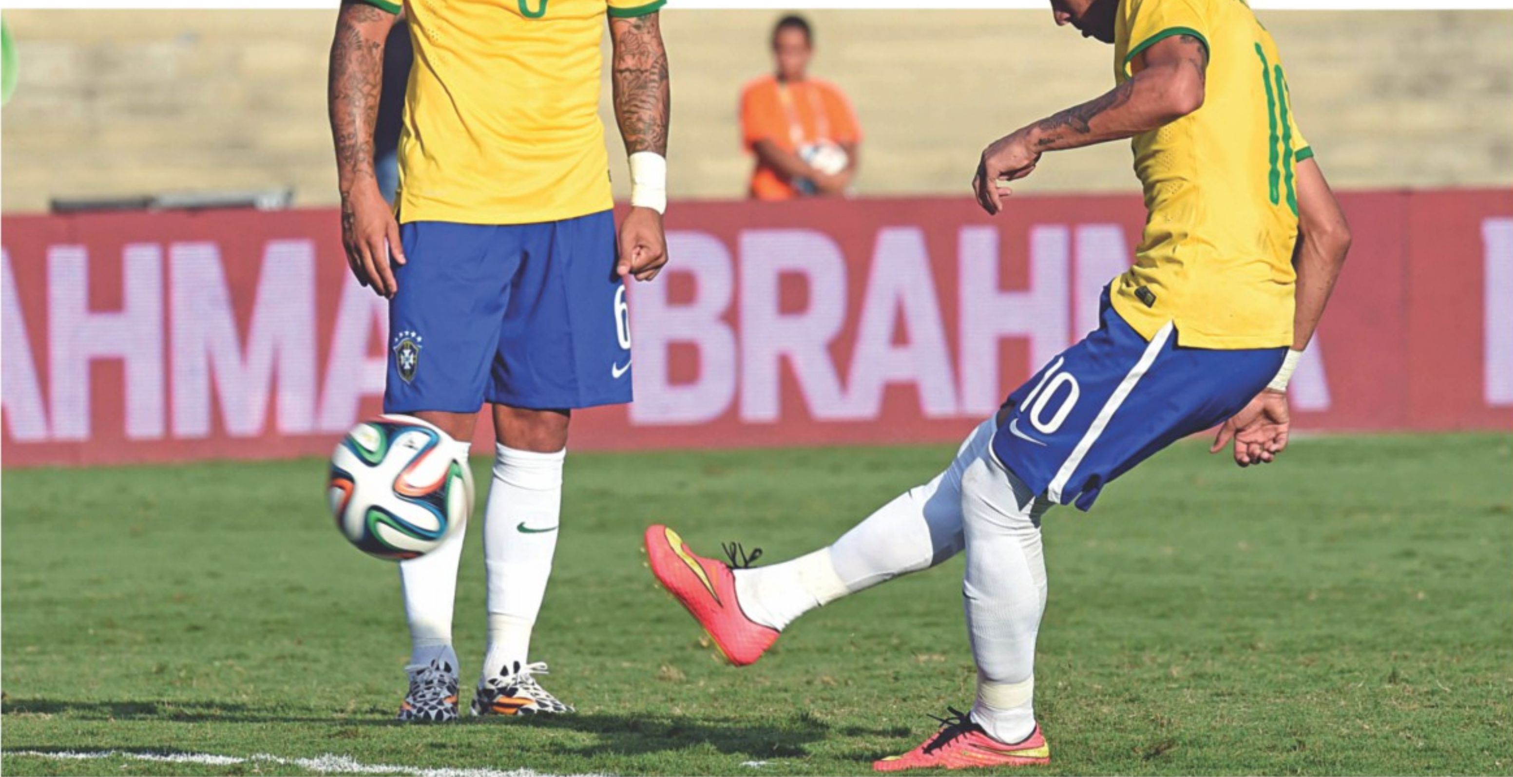
Brazil star Neymar (R) scores the opening goal from a freekick during their international friendly against Panama at the Serra Dourada Stadium on Tuesday.

Neymar was not interested in allowing anyone game time at his expense, however, and it was his superbly weighted backheel which allowed Hulk to slot in a cool third with the outside of his boot.