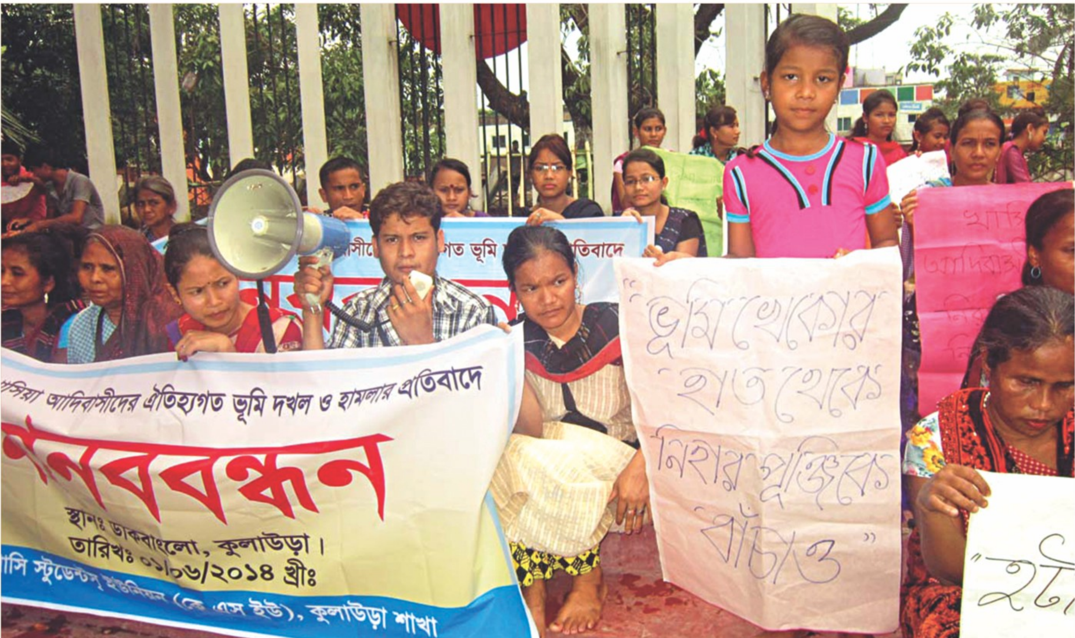
An indigenous man uses a megaphone voicing the demands for punishment of the alleged land grabbers who attacked Khasis in Srimangal on Friday, during a human chain in front of Kulaura Shaheed Minar in Moulvibazar yesterday. Ten rights organisations took part in the protest.

ROOPPUR NUKE POWER PLANT Cabinet okays $199m Russian hard-term export credit STAFF CORRESPONDENT