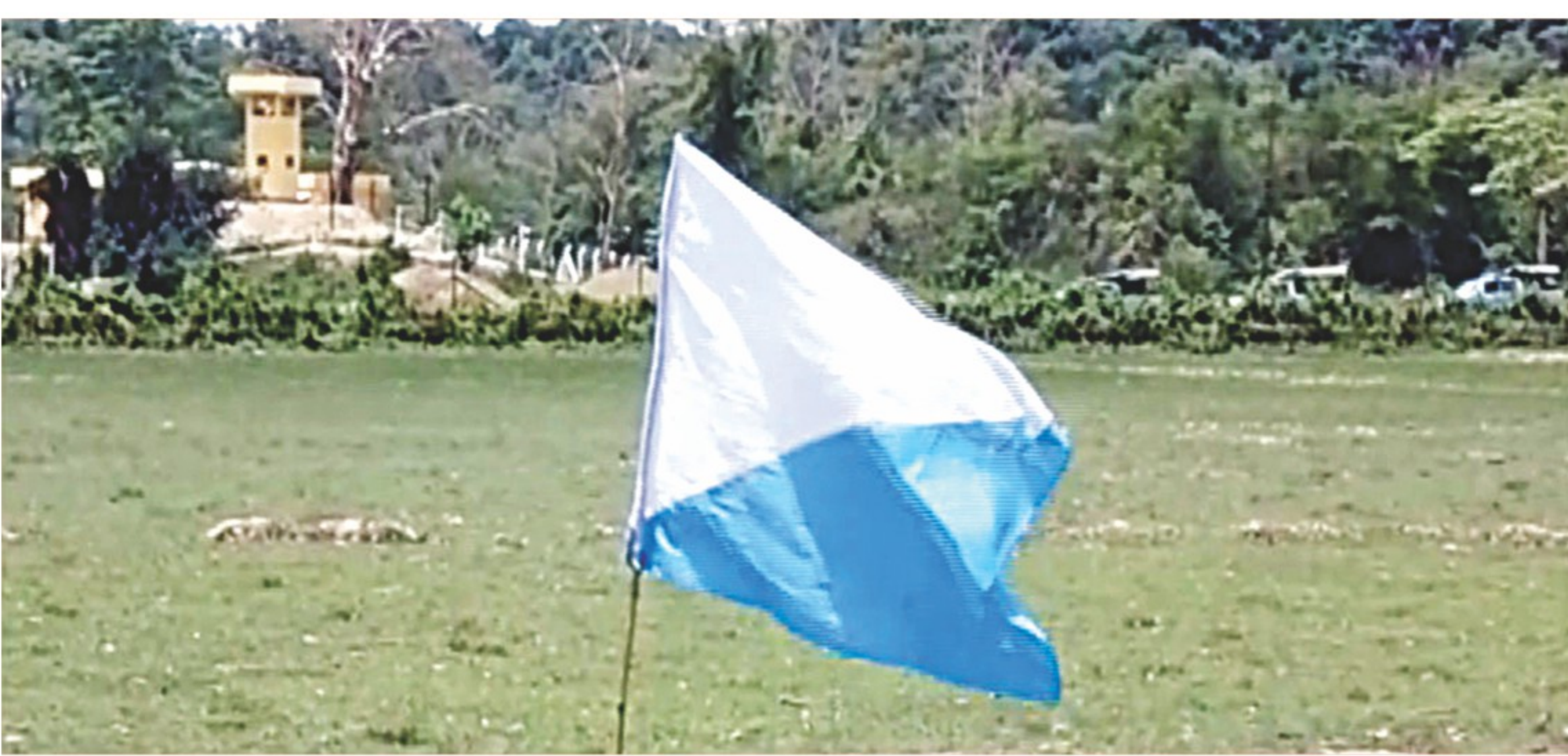
Border Guard Bangladesh planted a flag at the border with Myanmar in Naikkhangchhari of Bandarban on Friday asking for a flag meeting with Myanmar border guards.

The Myanmar border troops had reportedly intruded SEE PAGE 2 COL 2