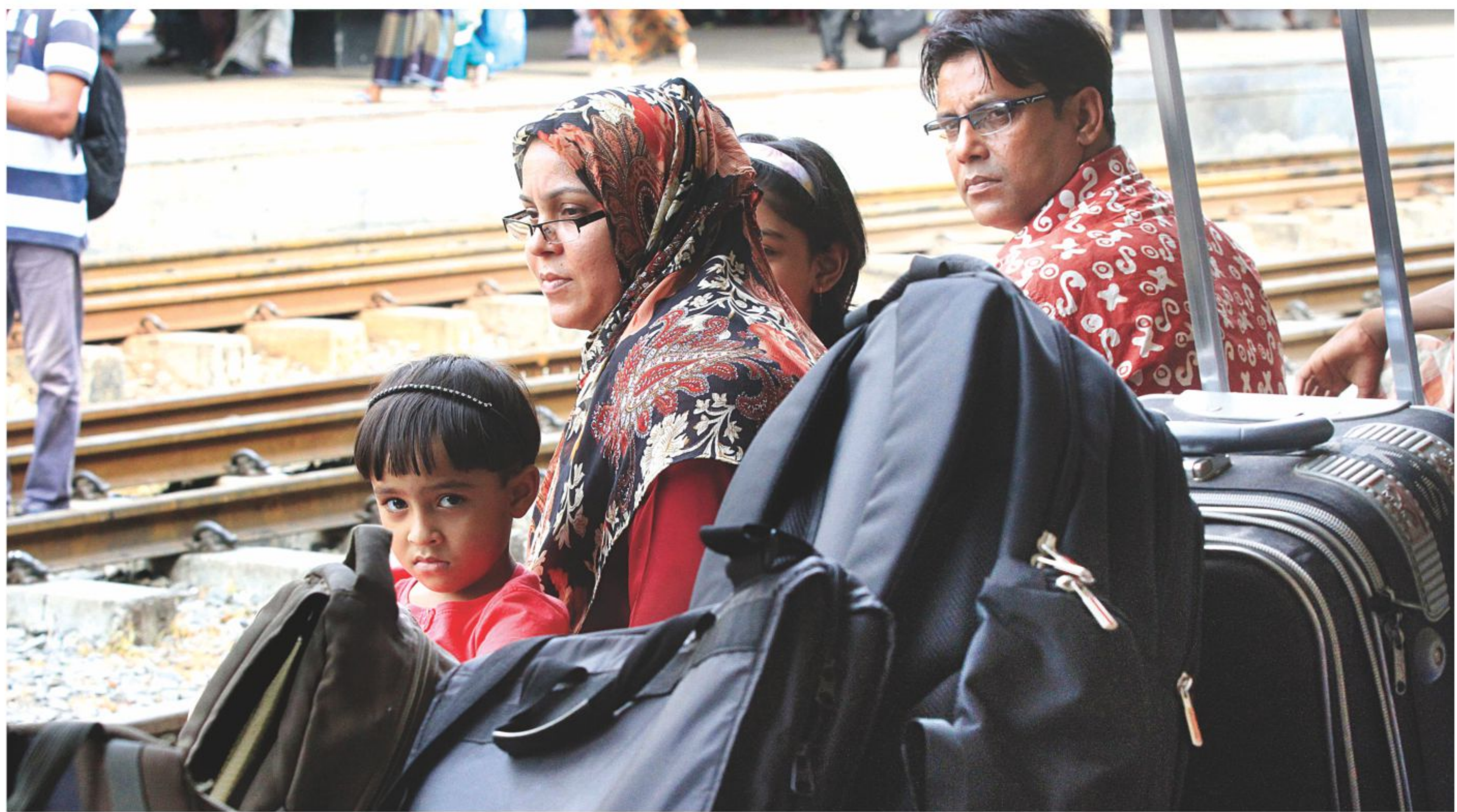
Passengers wait for a train at Kamalapur Rail Station yesterday afternoon. The train schedule in Dhaka and other districts got disrupted due to the pressure of extra passengers during the bus strike in the northern districts and greater Mymensingh. The strike, however, was withdrawn in the evening.

STAR REPORT Transport owners and workers of northern districts and greater Mymensingh have withdrawn their strike, but CNG-run auto-rickshaw owners in the capital yesterday called a 72-hour strike causing immense suffering to city dwellers. The decision of withdrawing the strike came last evening following assurance of the government to sit with the transport leaders to discuss their demands immediately, said officials of the communications ministry and transport leaders. "We have withdrawn our strike as the communications minister has assured us to fulfil our demand," said Momtaz Uddin, president of Mymensingh Transport Owners Association. "After getting assurance from the government high-ups that our demands will be considered with enough priority, we have decided to postpone the strike for ten days," Manzur Rahman Peter, convener of Rajshahi Bus Truck Owners and Workers Oikya Parishad, told The Daily Star.