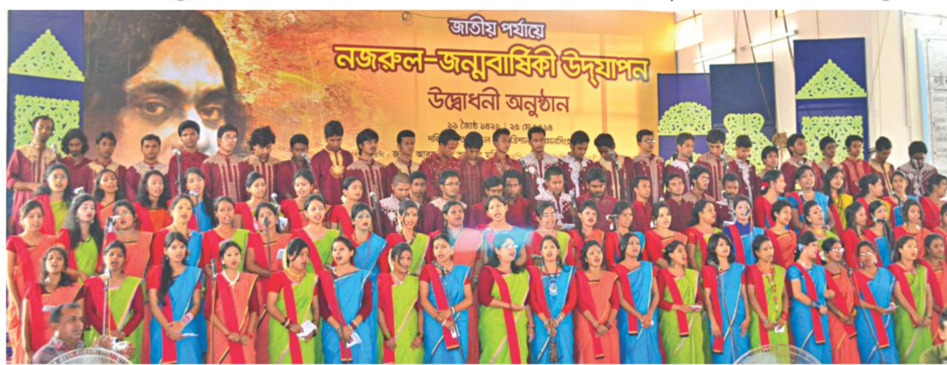
A chorus performance on the opening day of the festival.